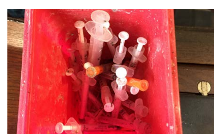
Sharps disposal incorrect (above): Container is not sealed. Sharps disposal correct (below): Container is sealed and properly labeled.

Workers should know how to handle and dispose of needles and other sharps they find in trash receptacles, parking lots, public restrooms, and on sidewalks. Improper disposal raises the risk of exposures to other workers and the public. Take proper precautions when handling needles and other sharps: