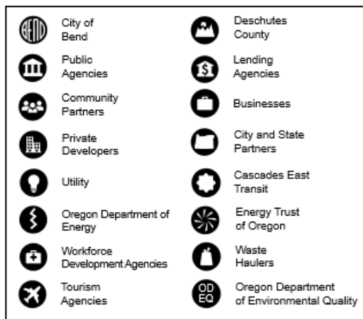
Figure 1: City of Bend Implementation Responsibilities

CAPs also contain GHG reducing actions over which the municipality has little to no control. Most CAPs reviewed for this report identify opportunities to engage with community partners to help accomplish goals and meet targets. For example, partnerships have been useful for communities that have goals for significant reduction of residential energy consumption. The City of Bend has a simple visual representation for implementation responsibilities ( See Figure 1 ). Note that this implementation table does not determine the specific department within the City of Bend and remains vague on purpose. Omitting a specific department allows the Bend flexibility of spreading and sharing departmental responsibility. In addition to flexibility, often the action items do not fall squarely within the purview of a single department and therefore require a multi-department led implementation.