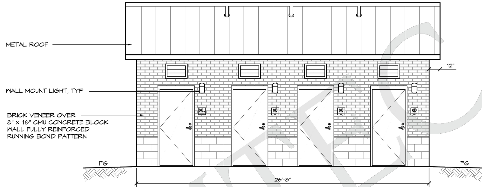
C ELEVATION VIEW SCALE: 1/4" = 1'-0"