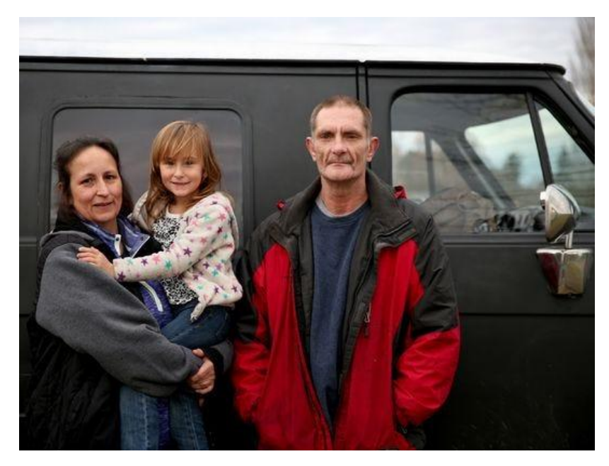
"There, but for the grace of God, go I"