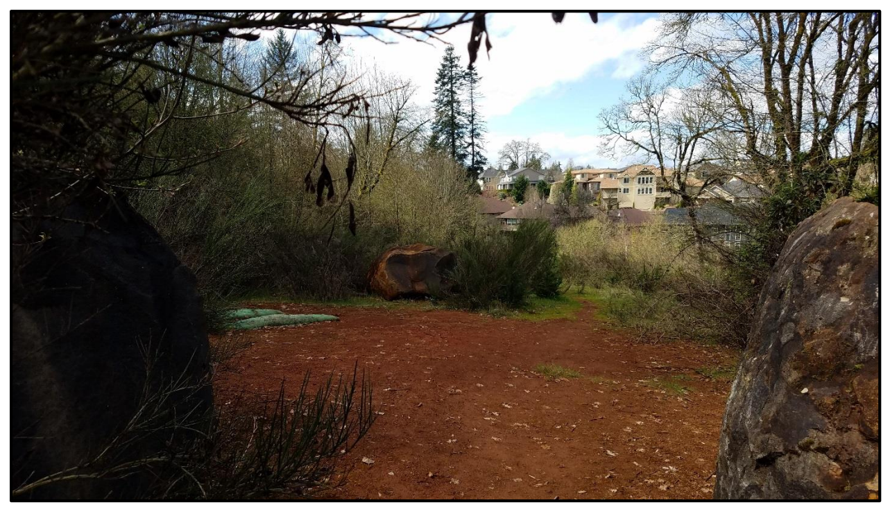
Section of Lone Oak Road immediately south of the box culvert over Jory Creek.