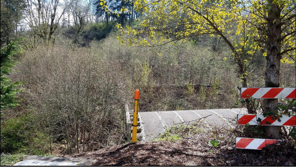
Golf Club Estates at Creekside Photos of the Missing Segment of Lone Oak Road SE