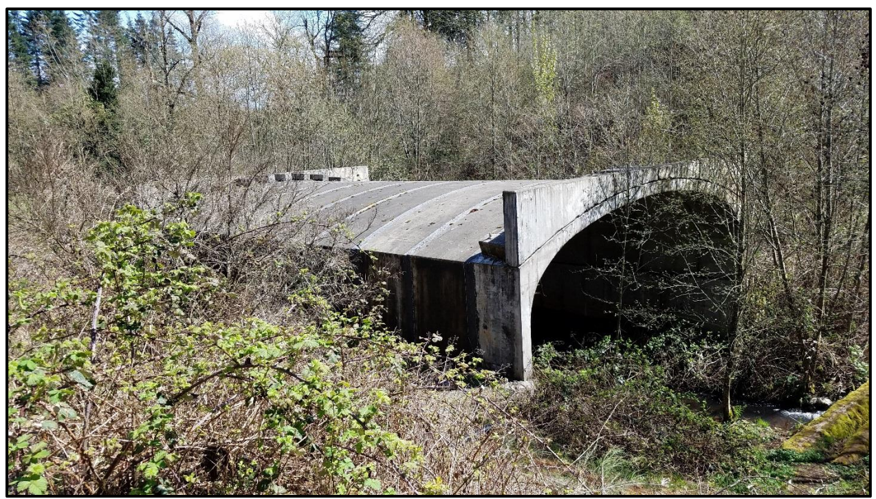
Box culvert over Jory Creek at southern terminus of Lone Oak Road, near Muirfield Avenue