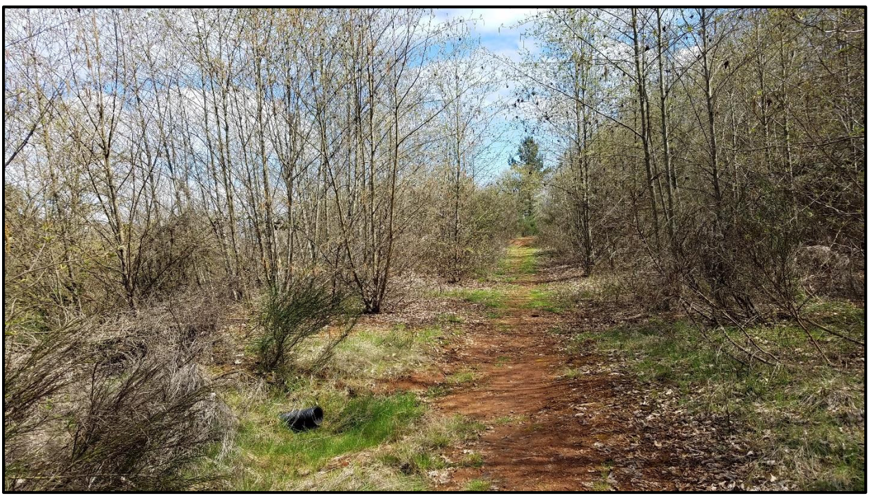
Section of Lone Oak Road between barricades near Augusta Street to the south and box culvert over Jory Creek to the north.