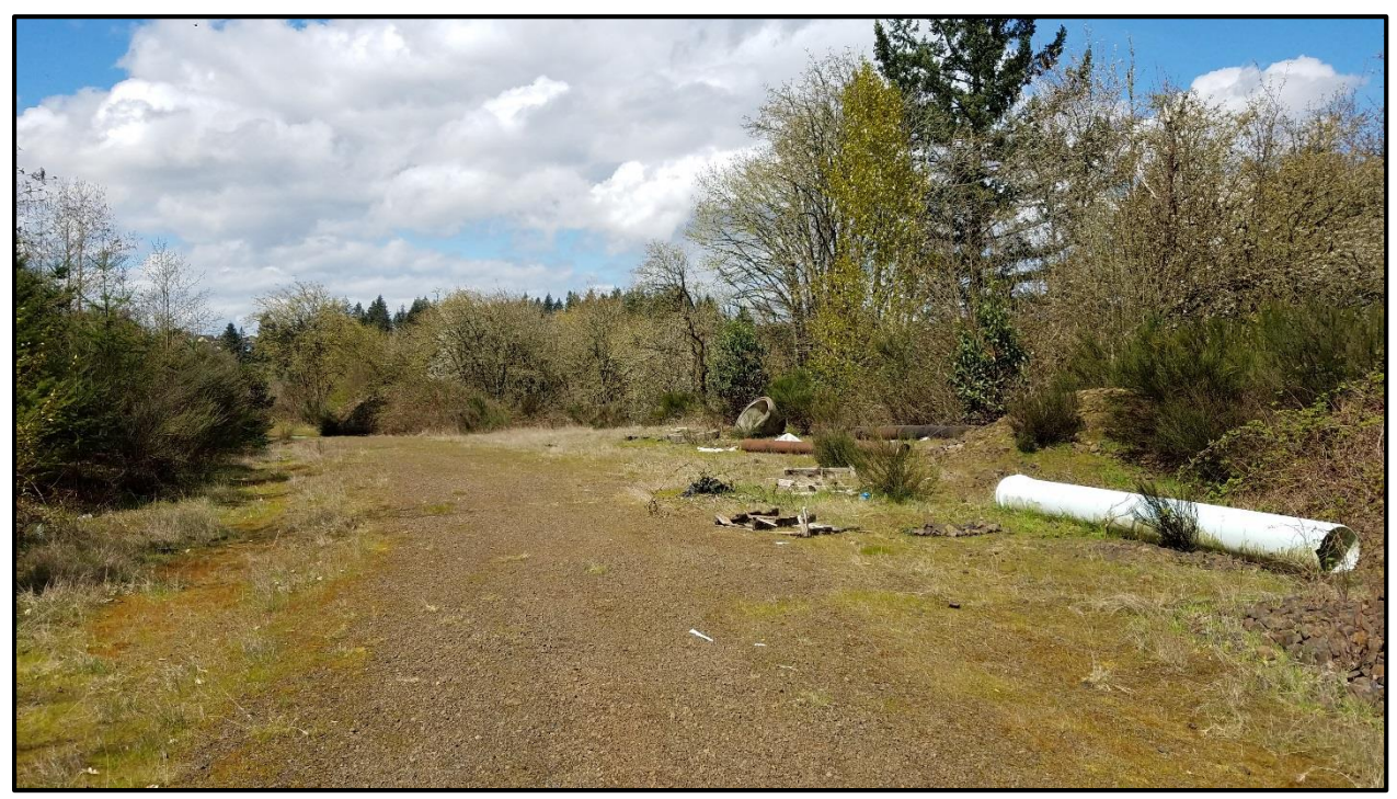
Beyond the barricades, looking north, showing initial grading of Lone Oak Road. [Unused water pipe, sewer pipes, and manhole are on the right edge of the road.]