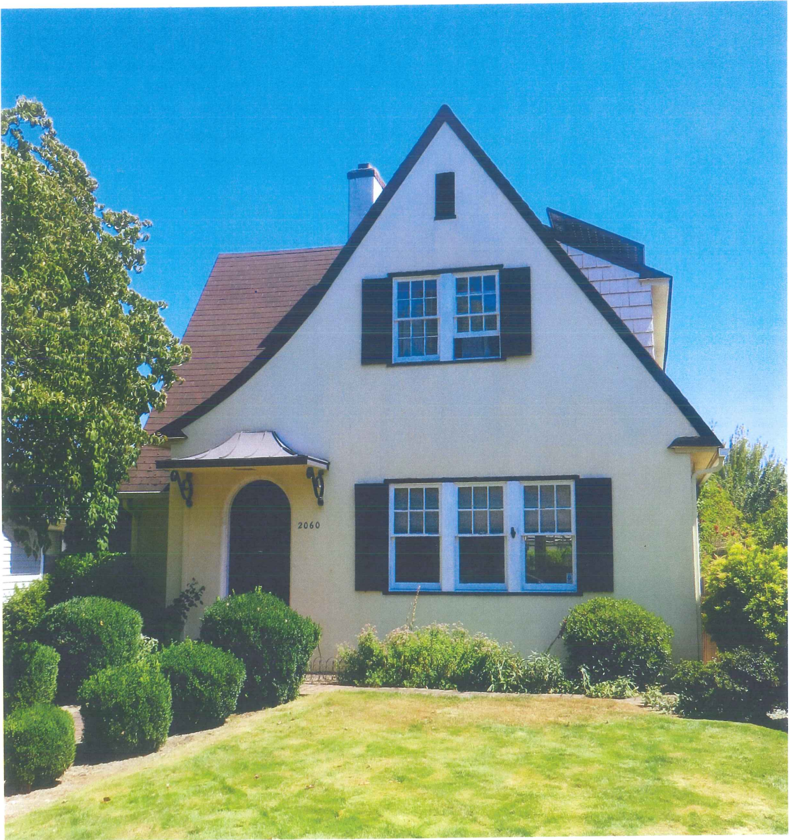
2060 High St SE - Exterior