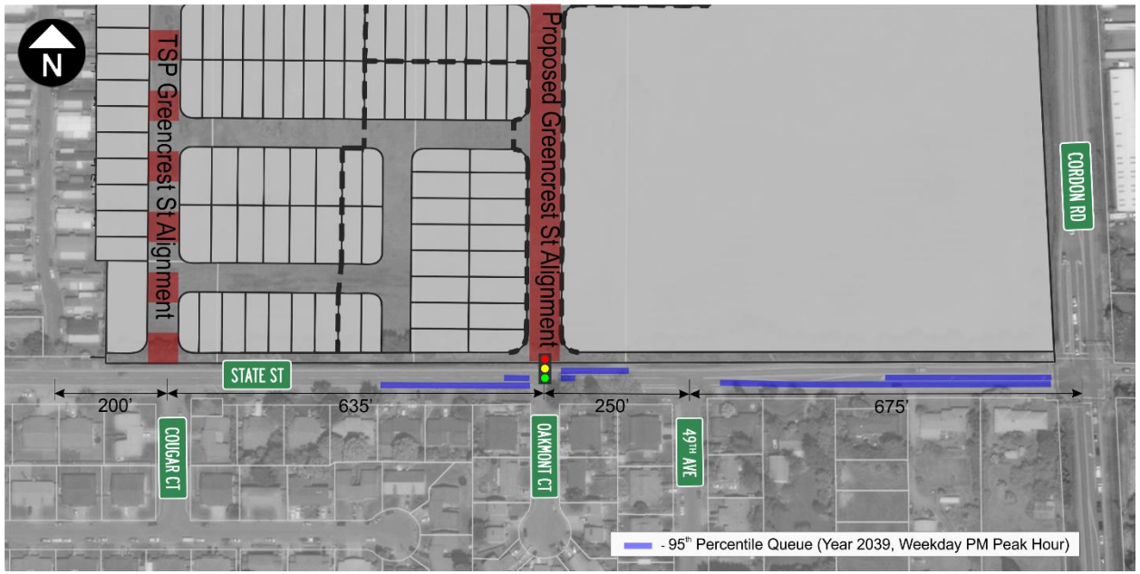
Figure 2. Street Spacing and Projected 95<sup>th</sup> Percentile Queues on State Street.