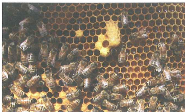
Figure 13: Sealed supersedure or emergency queen cells that indicate either the death of the queen or a poor-quality queen. Unlike swarm queen cells, emergency or supersedure queen cells are typically located on the face of the comb and will be few in numbers (i.e., one to three cells in the case of supersedure).

Colonies that become queenless are often more defensive as they gradually become populated with older bees. Colonies may lose queens in a number of different ways, including when queens are accidentally crushed by the beekeeper during colony inspection, when they die of old age or disease, or are superseded. Supersedure is a process when the workers decide that the queen is not productive enough and they replace her (Figure 13). Queenless colonies are easily identifiable by emergency queen cells that are added to the face of brood frames within 1 to 2 days of the queen being lost and by the absence of newly laid eggs within 4 days of the queen being lost. If the colony fails to produce a new queen, it will not rear a new queen (such a colony is termed "hopelessly queenless"). A hopelessly queenless colony becomes very defensive and is difficult to requeen. For this reason, it is important to identify queenless colonies