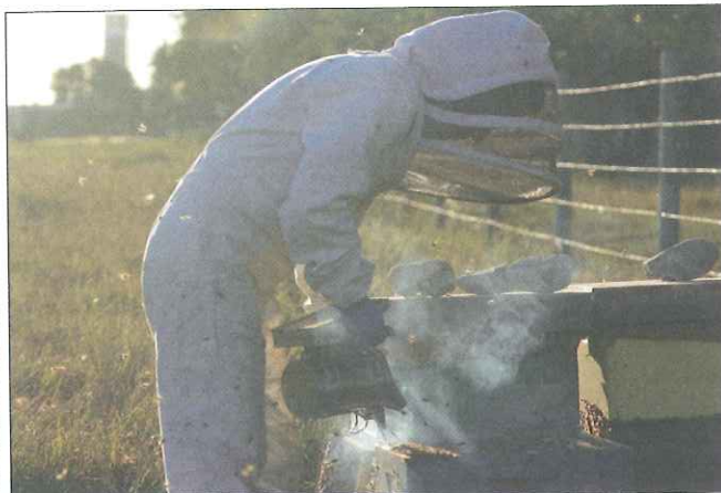
Figure 7: A well-lit smoker is a key feature of working colonies. Colonies should be smoked before opening and periodically smoked during the course of the colony operation.