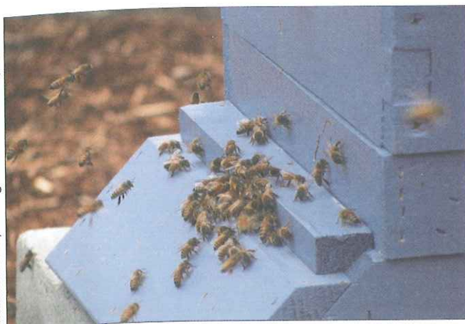
Figure 10: An entrance reducer allows bees to defend their entrance, reducing overall colony defensiveness during periods of robbing.