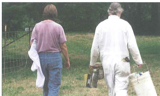
Figure 14: Residential beekeepers should be prepared to answer neighbors' questions about bees, as it can be an excellent opportunity to educate the public.

early. Requeening can sometimes be difficult; new beekeepers should consult a more experienced beekeeper before proceeding.