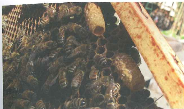
Figure 12: Advanced swarm queen cells that will be capped within 1 to 2 days. Queen cells associated with swarming typically form on the edges of the comb, often on the bottom bars of the comb. Prior to a swarm, there will be around a dozen or more cells present.