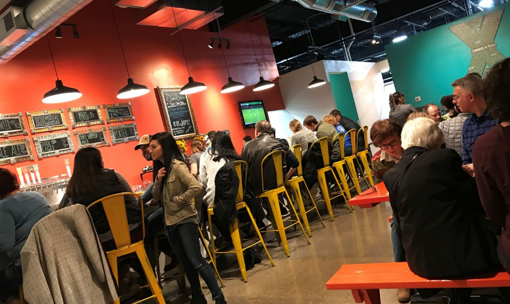
XICHA Brewing West Salem's First Craft Brewery