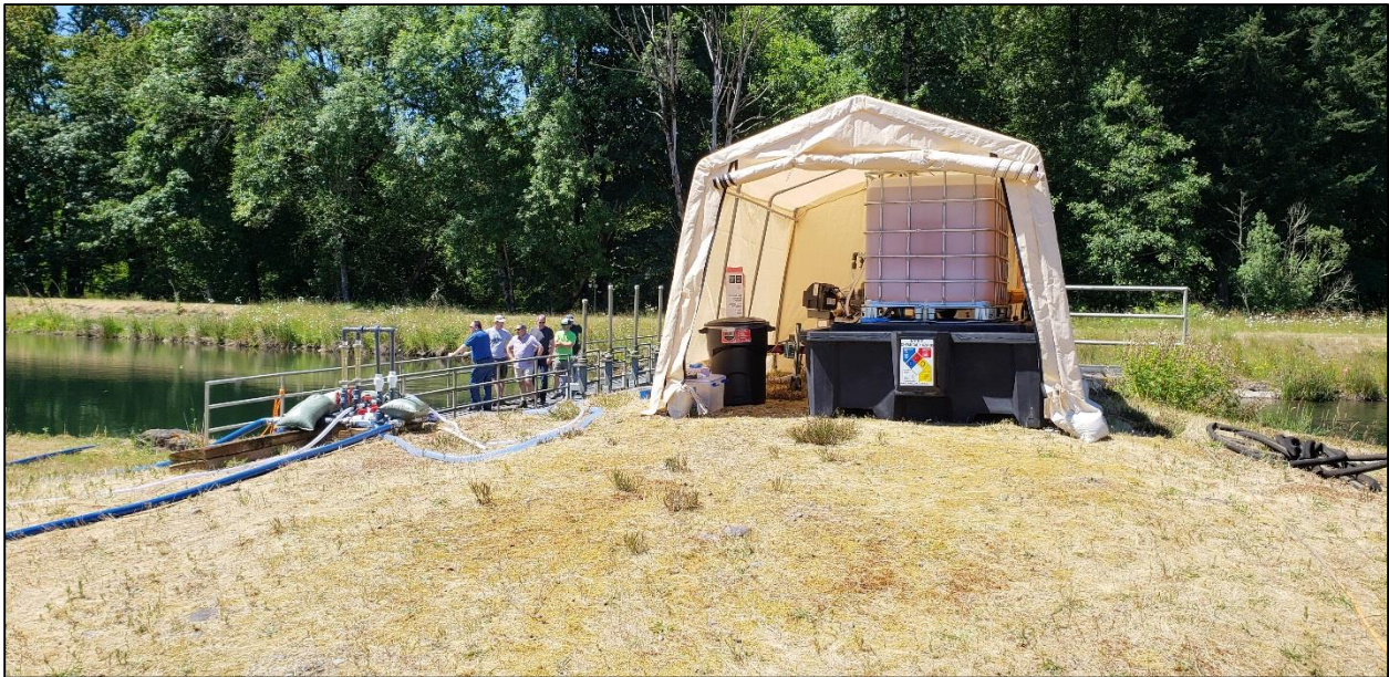
Geren Island Water Treatment Plant. Demonstration testing. Polymer injection mechanism under shelter, mixing manifold for polymer and alum to the left.