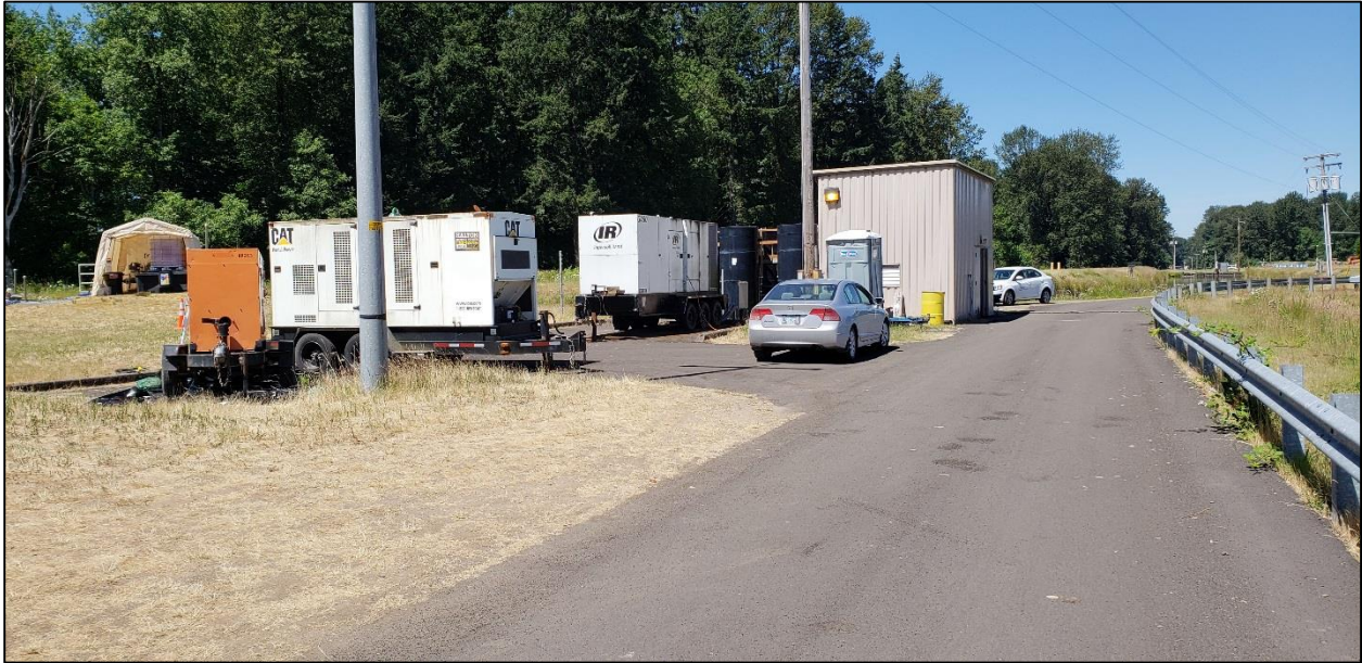
Geren Island Water Treatment Plant. Pilot testing is taking place in the building at right and in the black upright columns to the left of the building. Power and backup power generators in place. Shelter for Polymer injection mechanisms on left.