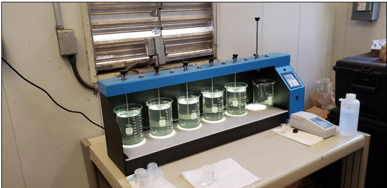
Geren Island Water Treatment Plant. Ongoing pilot testing of the performance of Powdered Activated Carbon (PAC) and effectiveness of PAC settling using cationic polymer/alum combinations.