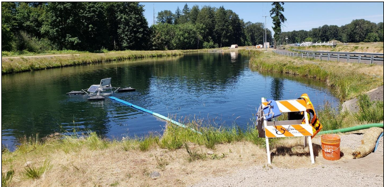
Geren Island Water Treatment Plant. For demonstration testing. Intake channel with one of the Solar Bees ® solar-powered mixers pre-positioned. PAC injection occurs here. Tent containing polymer injection mechanism in background