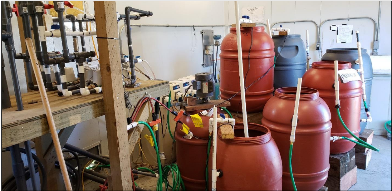
Geren Island Water Treatment Plant. Ongoing pilot testing of the performance of Powdered Activated Carbon (PAC) and effectiveness of PAC settling using cationic polymer/alum combinations.