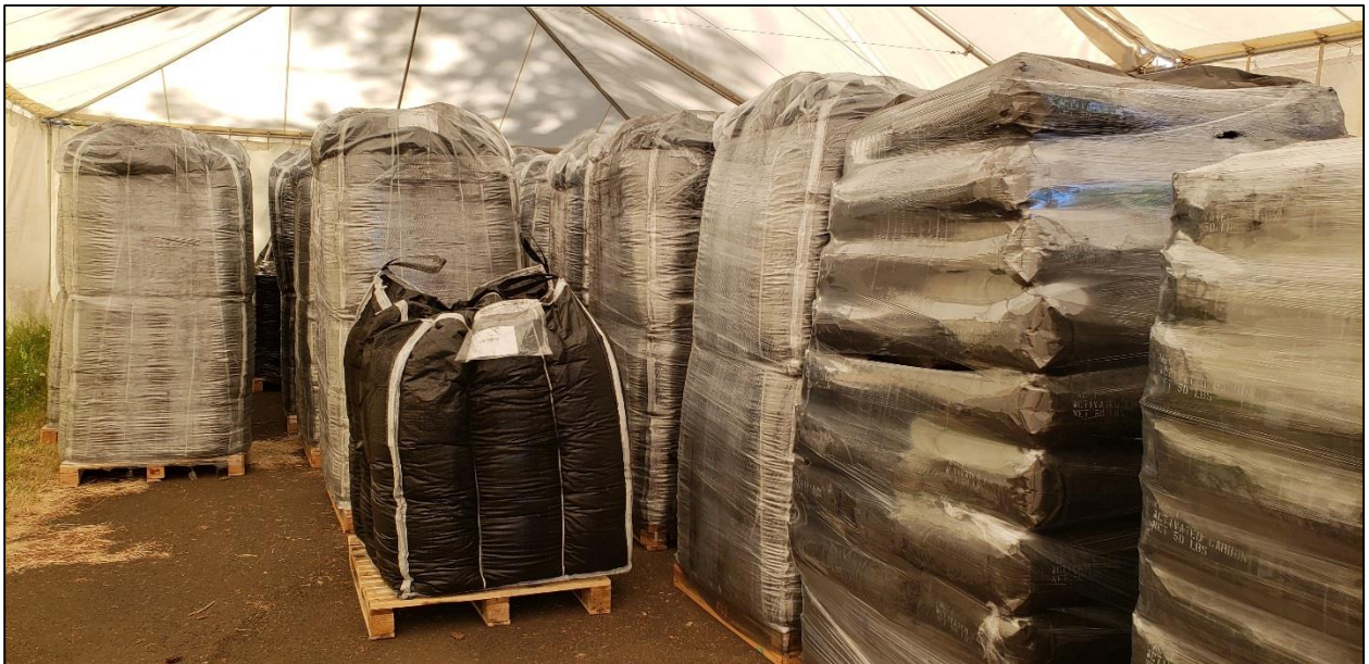
Geren Island Water Treatment Plant. Powdered Activated Carbon (PAC) in storage.