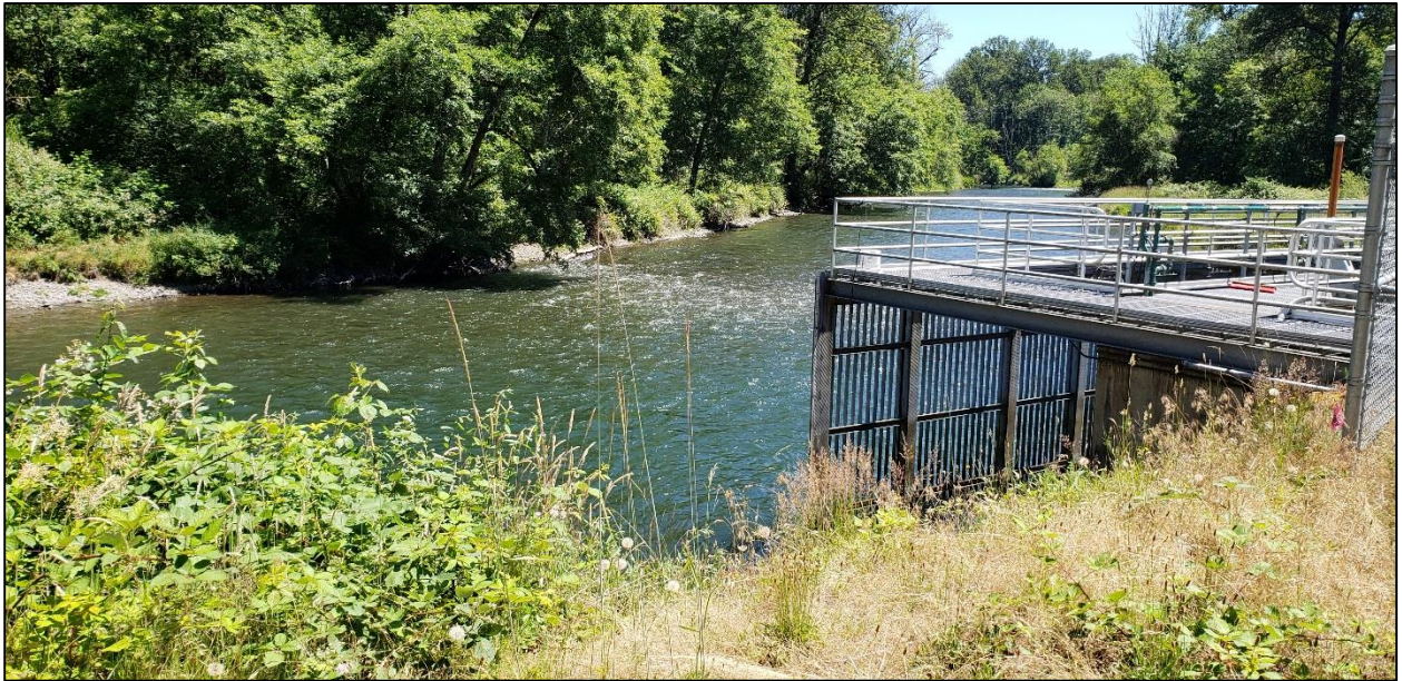
Geren Island Water Treatment Plant. Intake from the North Santiam River.