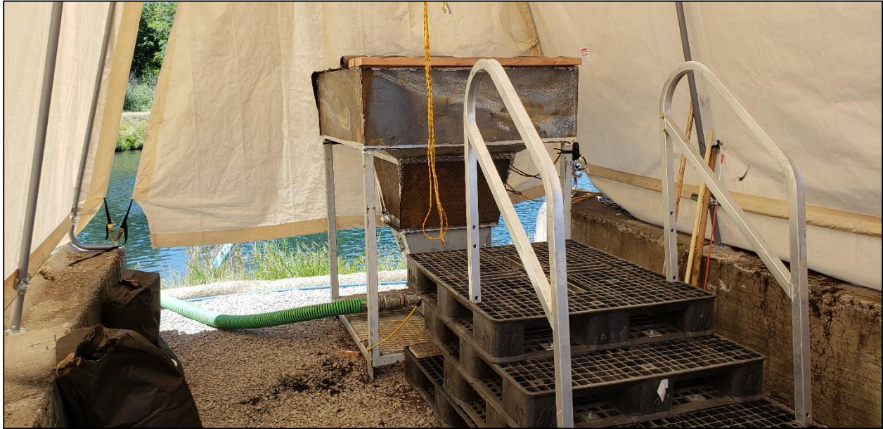
Geren Island Water Treatment Plant. For demonstration testing. Powdered Activated Carbon addition hopper and discharge line to Solar Bee ® for diffusion in the channel.