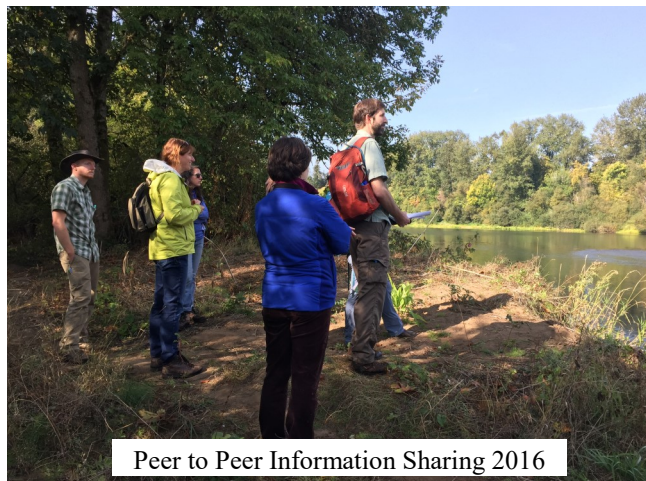
Peer to Peer Information Sharing 2016

Important Note: All actions outlined in the plan are dependent on volunteer participation by willing watershed landowners, cities, counties and state and federal agencies.