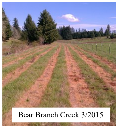
Bear Branch Creek 3/2015

The NSWC Project Managers regularly monitor riparian plantings for survival, growth, and maintenance needs. The NSWC uses grant funds to contract annual spring and fall plant establishment activities geared towards achieving high levels of native cover and low levels of non-native cover. The NSWC commits to working with landowners with projects for up to five years or until the riparian native plantings are free-to-grow.