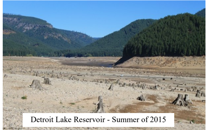
Detroit Lake Reservoir - Summer of 2015

The Santiam Water Control District (irrigation district) was awarded, through the Bureau of Reclamation (BOR), a 50/50 WaterSMART cost share grant to help fund the planning efforts. The grant was one of nine awarded in the nation. The irrigation district is the recipient of the grant, but has closely partnered with the North Santiam Watershed Council (NSWC) and others to expand the geographic scope to include the whole North Santiam basin, which is the main water source for multiple uses (drinking water, irrigation, recreation, instream aquatic habitat).