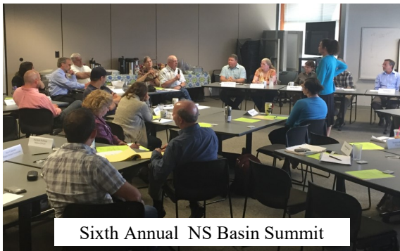
Sixth Annual NS Basin Summit

Staff from the North Santiam Watershed Council, City of Salem and Marion County have been convening watershed stakeholders every spring since 2011 to discuss important water management issues such as balancing conflicting uses, data management and distribution, communication and coordination and protecting habitat and water quality.