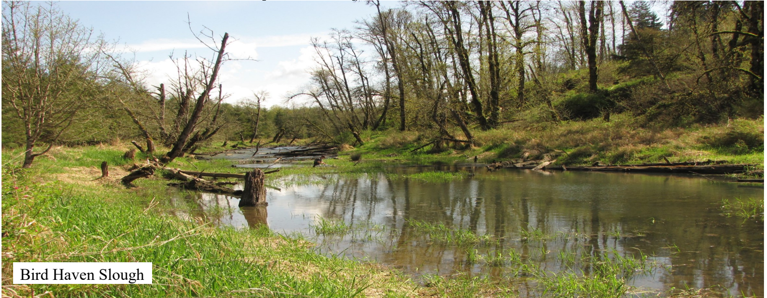
Bird Haven Slough