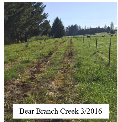
Bear Branch Creek 3/2016