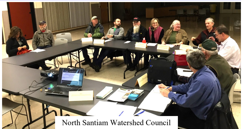
North Santiam Watershed Council

Email: council@nordsantiam.org Website: nordsantiam.org