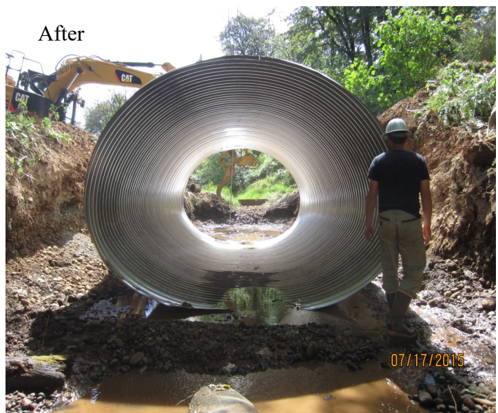
Bird Haven Slough Culvert Replacement Project (Before & After Photo) July 2015