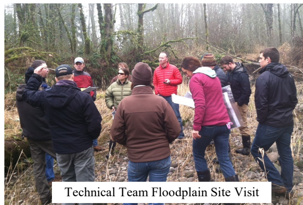
Technical Team Floodplain Site Visit

With the assistance of a technical team of tribal, federal, state and local area experts, 17 floodplain restoration projects were identified in the project area. Five of those projects were chosen to be incorporated into hydraulic models to determine feasibility and potential adverse effects of floodplain reconnection to adjacent landowners.