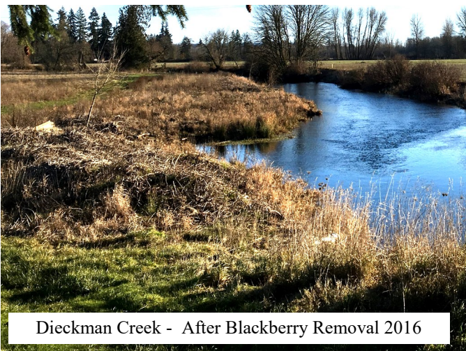
Dieckman Creek - After Blackberry Removal 2016

The NSWC has been working with the Eck Family since 2013 to plan and fund the restoration of 24 acres on Dieckman Creek, a side channel located in the lower North Santiam River floodplain. The landowners assisted with riparian site prep by removing old fencing and outbuildings in the riparian corridor. The NSWC used an OWEB Restoration grant leveraged with FSA CREP cost share funds to contract the removal of large reaches of invasive blackberry and reed canary grass. In the winter of 2016, project funds were used to purchase and plant over 48,000 native trees and shrubs along both sides of the section of Dieckman Creek running through the Eck's property. The Marion County Free Tree program also donated native trees to the project. The NSWC will assist the landowner with plant establishment efforts over the next five years or until the plantings are free-to-grow.