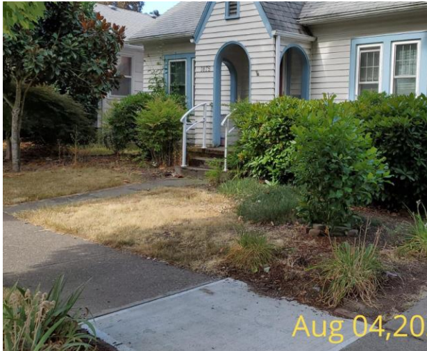
455 Oxford St SE- 300 Sq ft of sidewalk