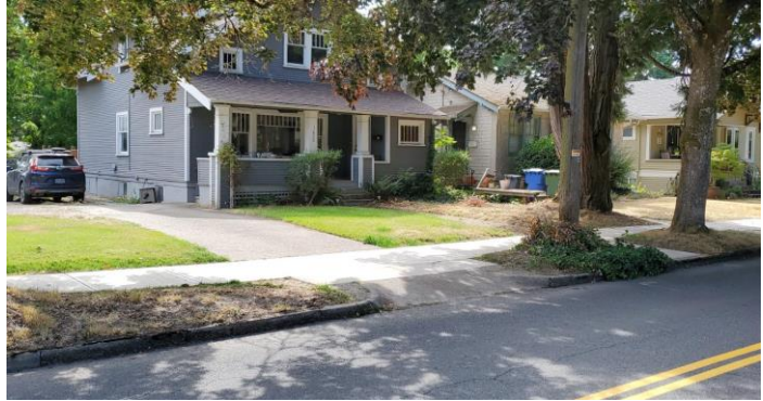
1080 Baxter Rd SE- 75 Sq ft of sidewalk