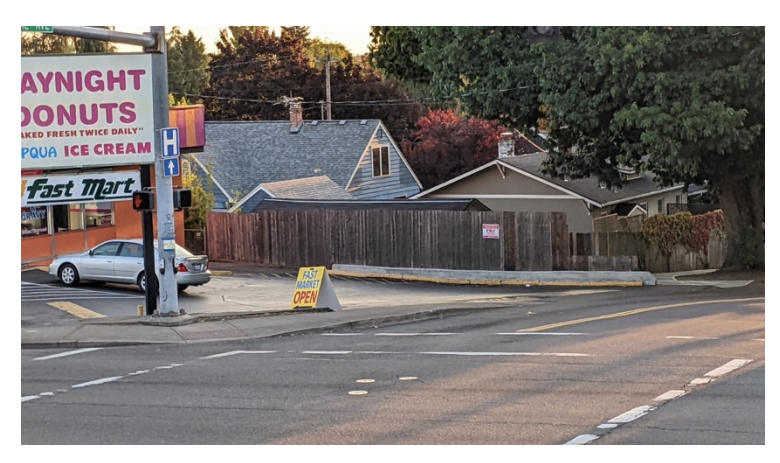
Photo 2 – Houses on West Knob Hill Street as seen from the parking lot at the SW corner of Commercial Street and Rural Avenue.