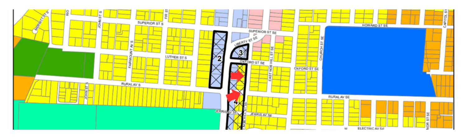
Top arrow on map indicates location of photo 1. Bottom arrow indicates location of photo 2.