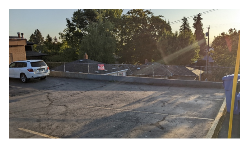
Photo 1 – Houses on Oxford Street as seen from the parking lot on Commercial Street.

It is critical to retain the 35-foot building height maximum in Overlay Zone 4, due to the 13-foot difference in grade between Commercial St and West Nob Hill St.