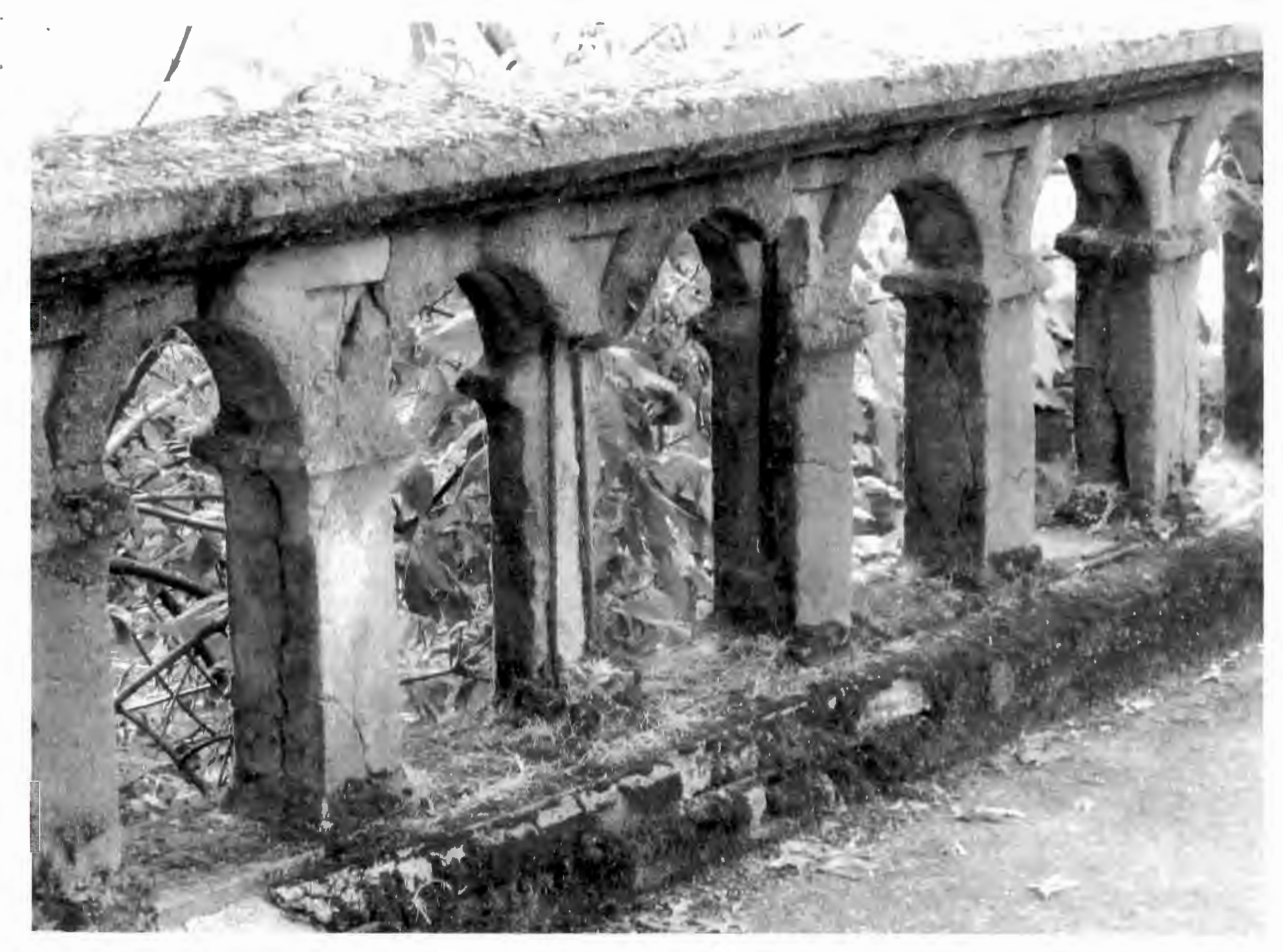
Deteriorating rail arches