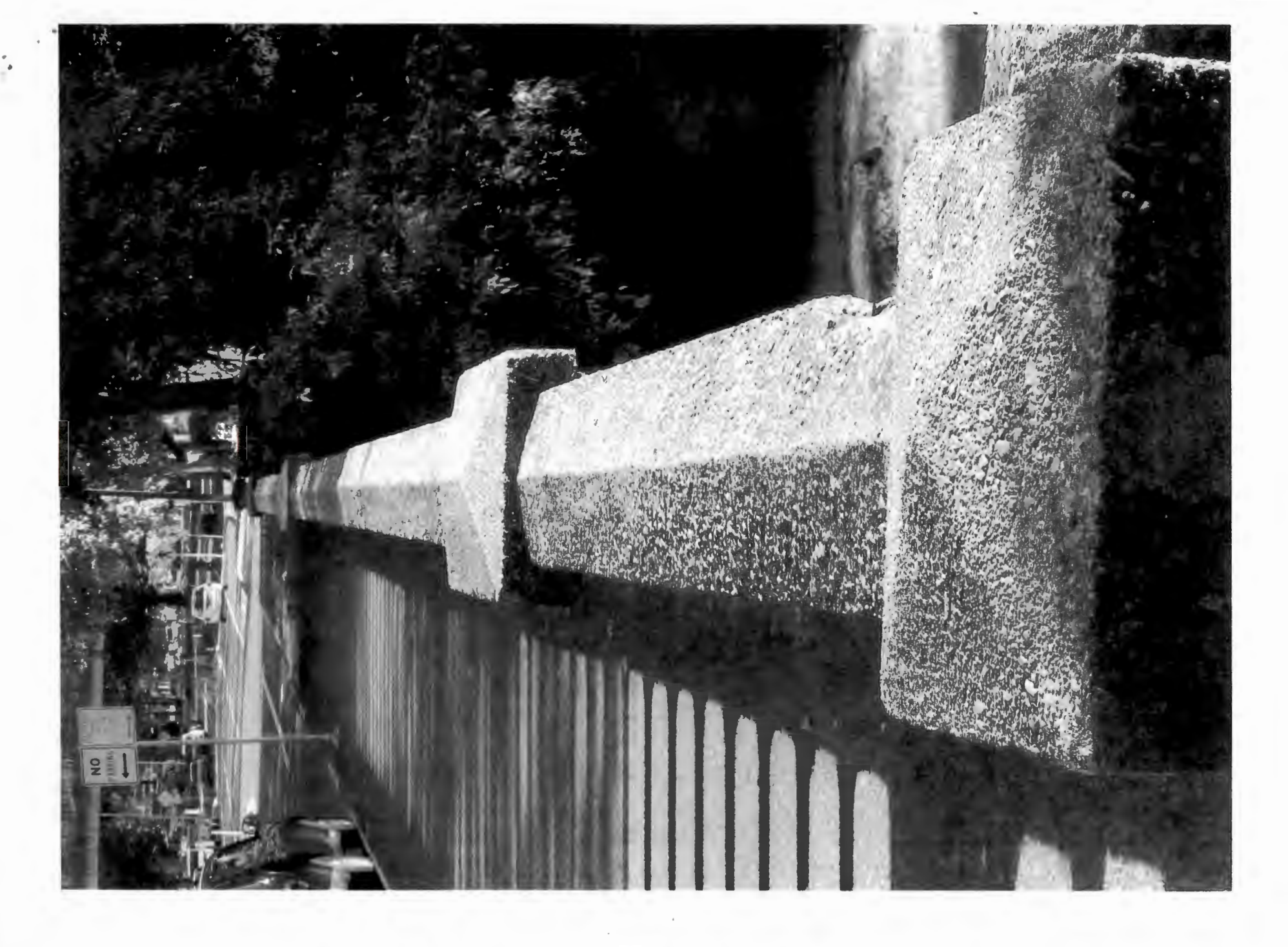
Balustrade without shading from vegetation