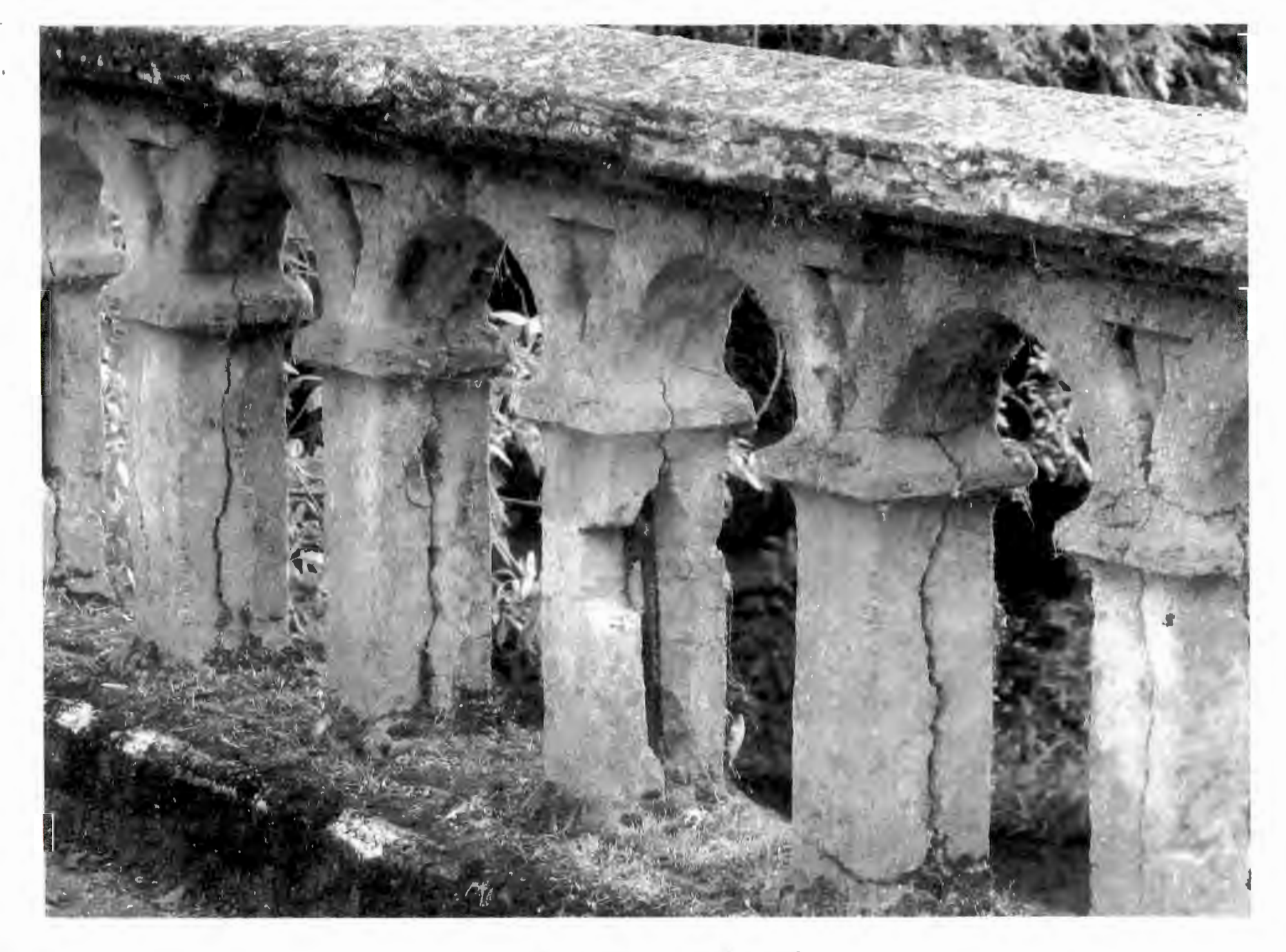
Deteriorating rail arches