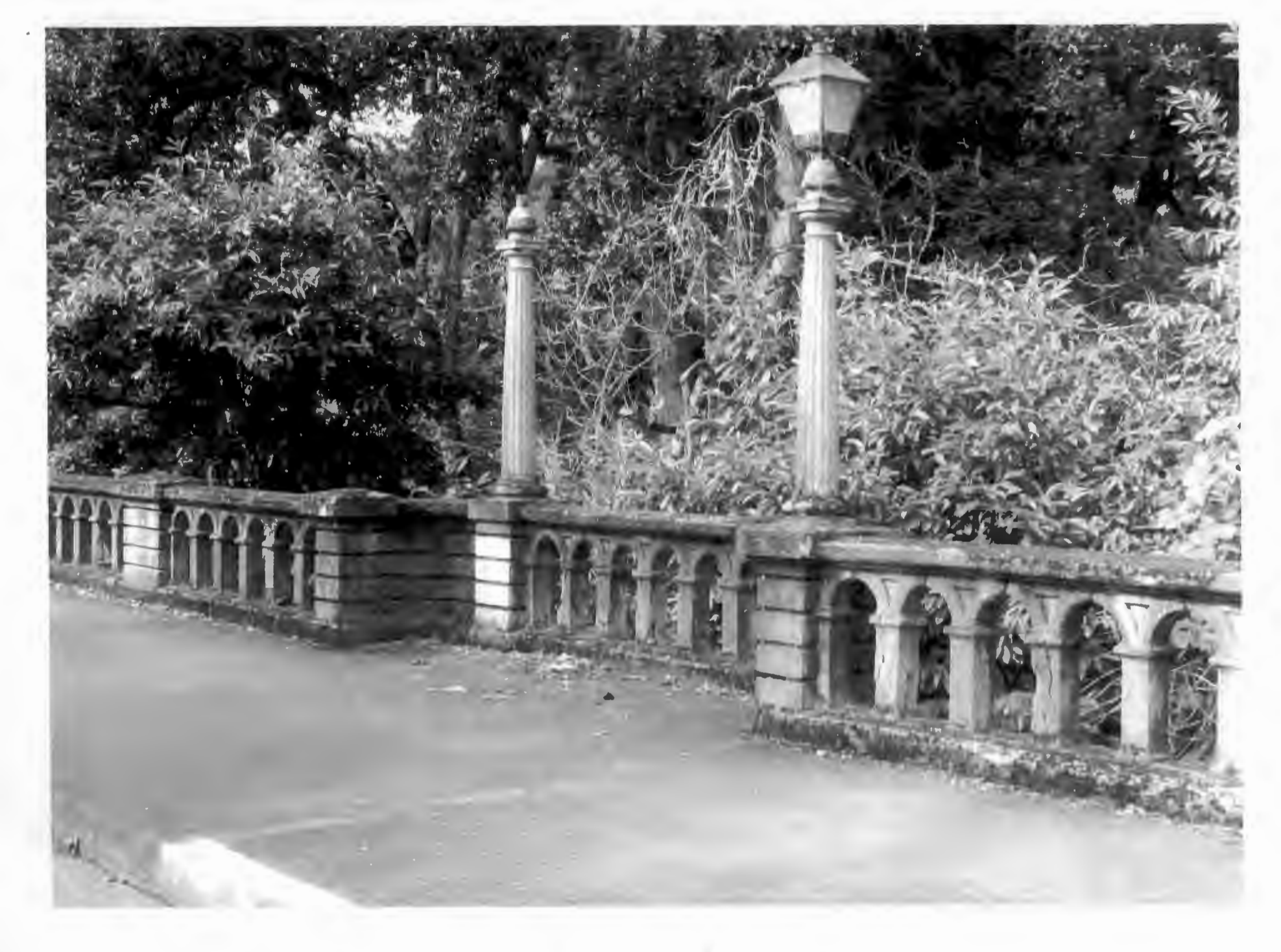
Post without lamp