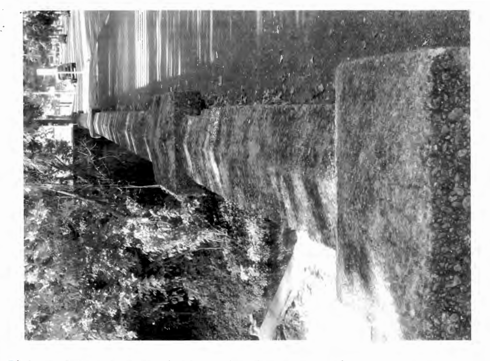
Biological growth on the bridge rail in the shadow of overgrown vegetation