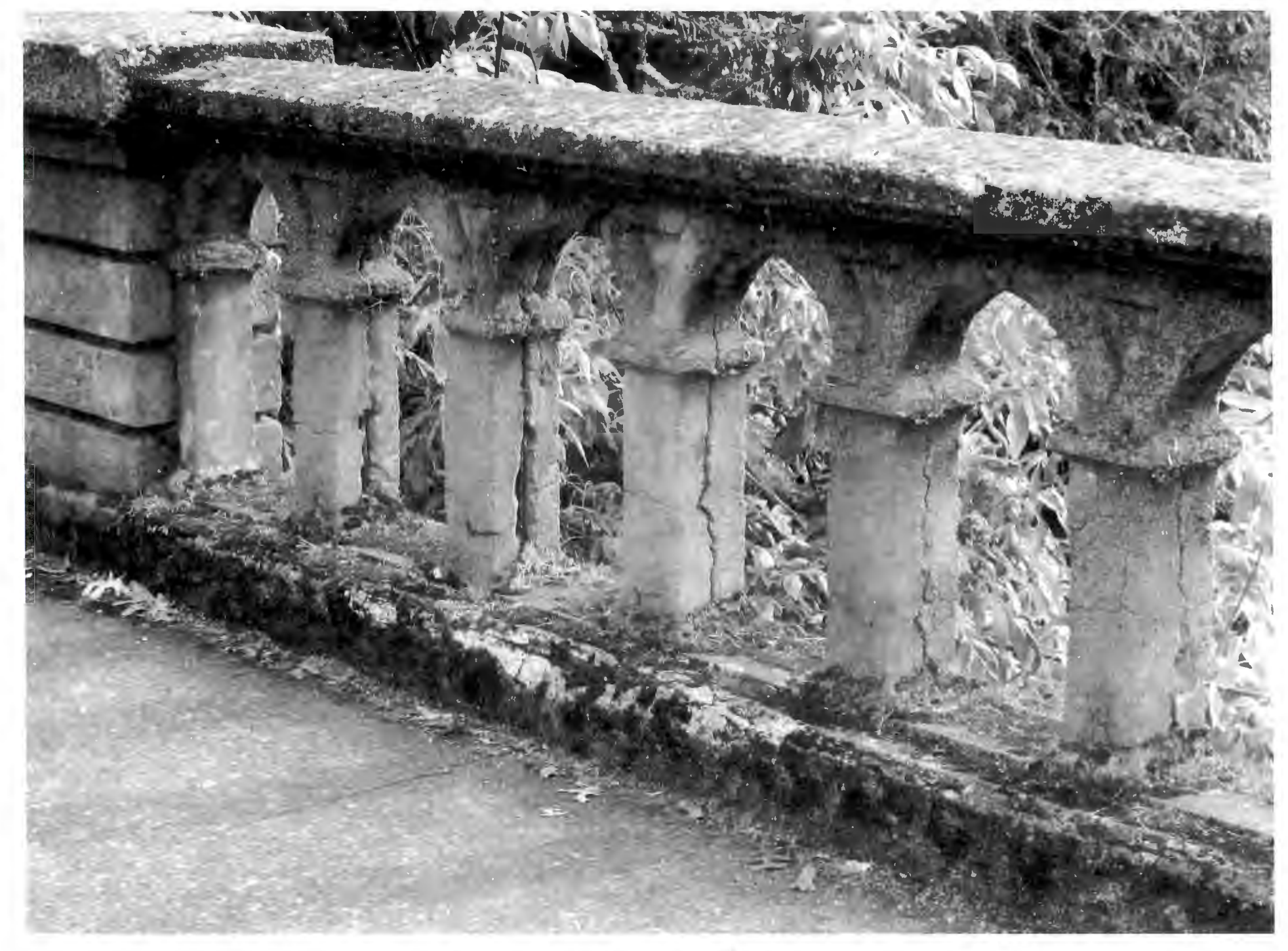
Deteriorating rail arches