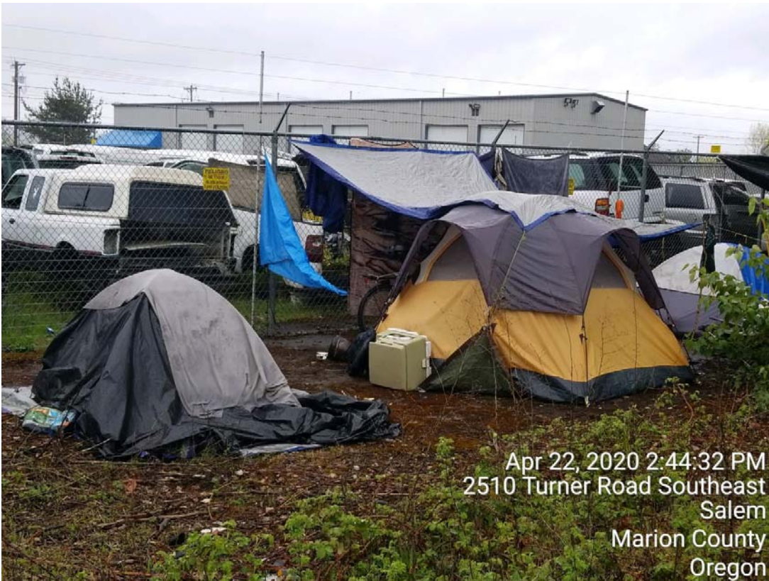
Homeless camp with many stolen bicycles adjacent to disc golf course and neighboring businesses.

Apr 22, 2020 2:44:32 PM 2510 Turner Road Southeast Salem Marion County Oregon