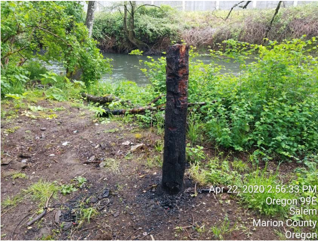
A young park tree cut down and burned for firewood in a homeless campsite.