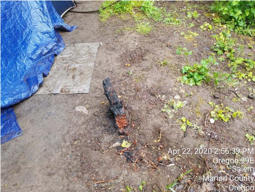
A young park tree cut down and burned for firewood in a homeless campsite.