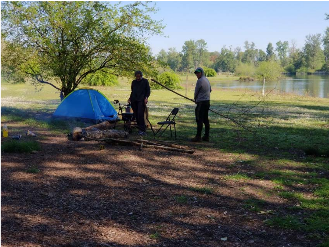
Homeless campers cutting down park trees for firewood.