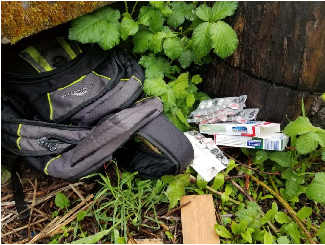
Drug cooking supplies adjacent to homeless campsite 100ft from Paradise Island Park.