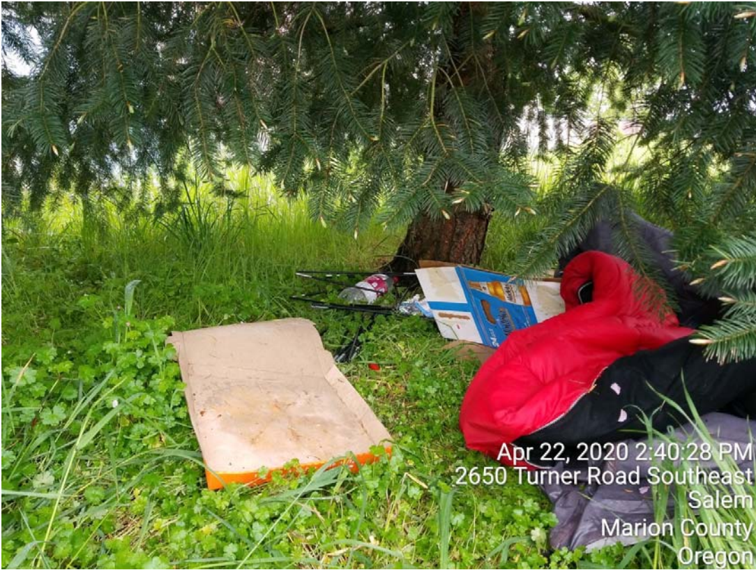
Trash left by homeless campers 20ft from paradise Island mobile home park.