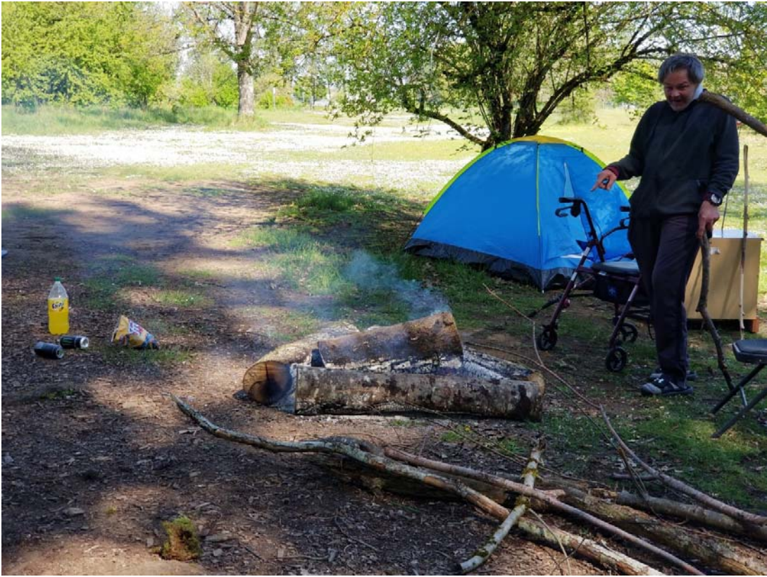
Campfire made from park trees.