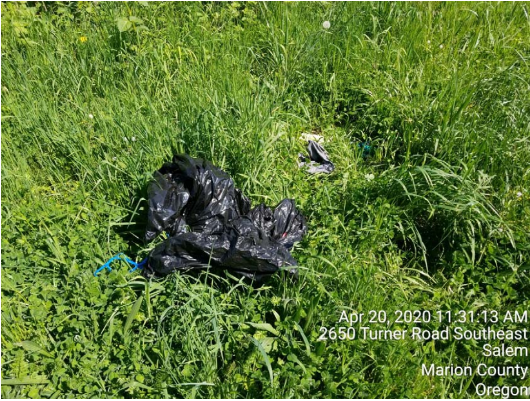
Garbage left by homeless campers on disc golf course.