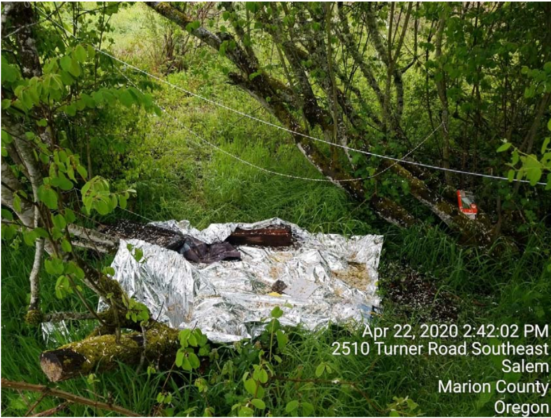
Garbage left by homeless campers adjacent to disc golf course.