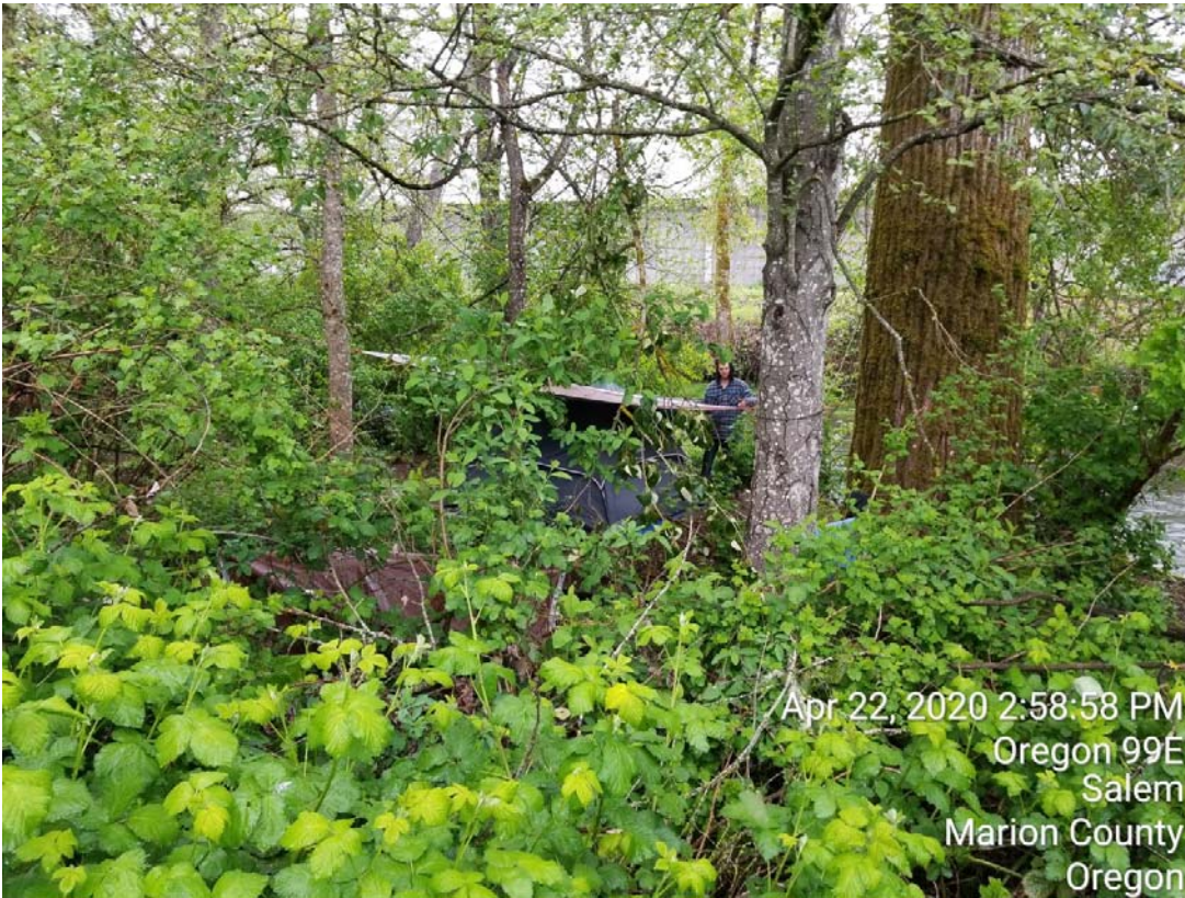
Man with a machete threatening me for taking photos of his campsite while he cuts down park trees.

We the board of the Southeast Mill Creek neighborhood Association implore you to take immediate action to save Cascades gateway park and our community from the destruction caused by Homeless campers. We look forward to working with the city to assist.