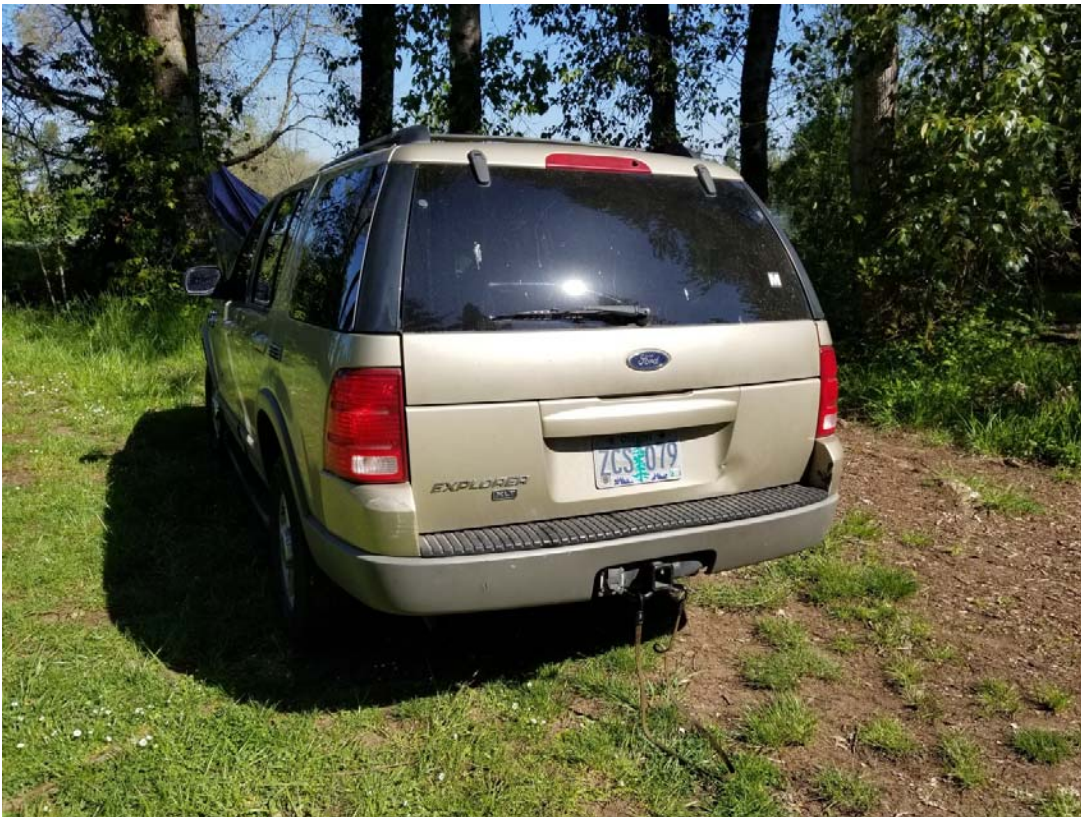
Homeless camper illegally driving his car on the Disc Golf course.

5. A task force should be established immediately to establish a post-pandemic homeless camping policy. SEMCA and Salem's residents are unwilling to permanently loose Cascades Gateway Park to homeless camps. A more permanent homeless village or some other system outside of Salem parks should be implemented to provide ongoing safe shelter for the homeless population.