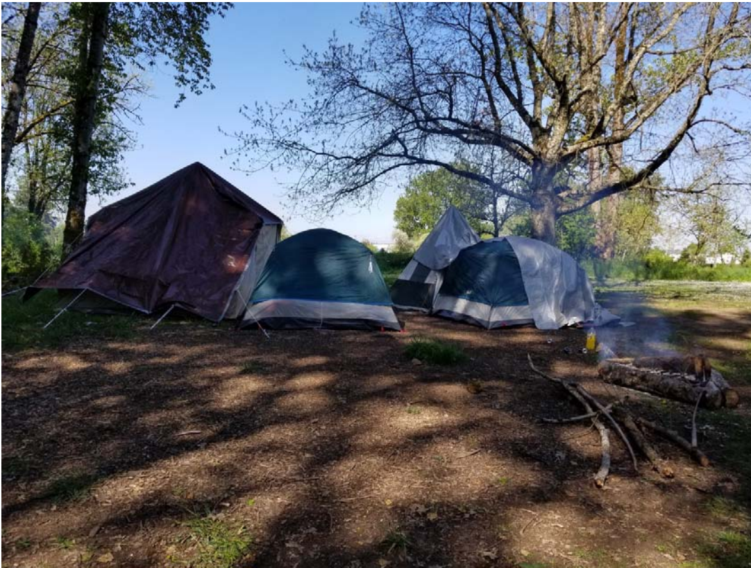
Homeless Camp set up on the disc golf course.