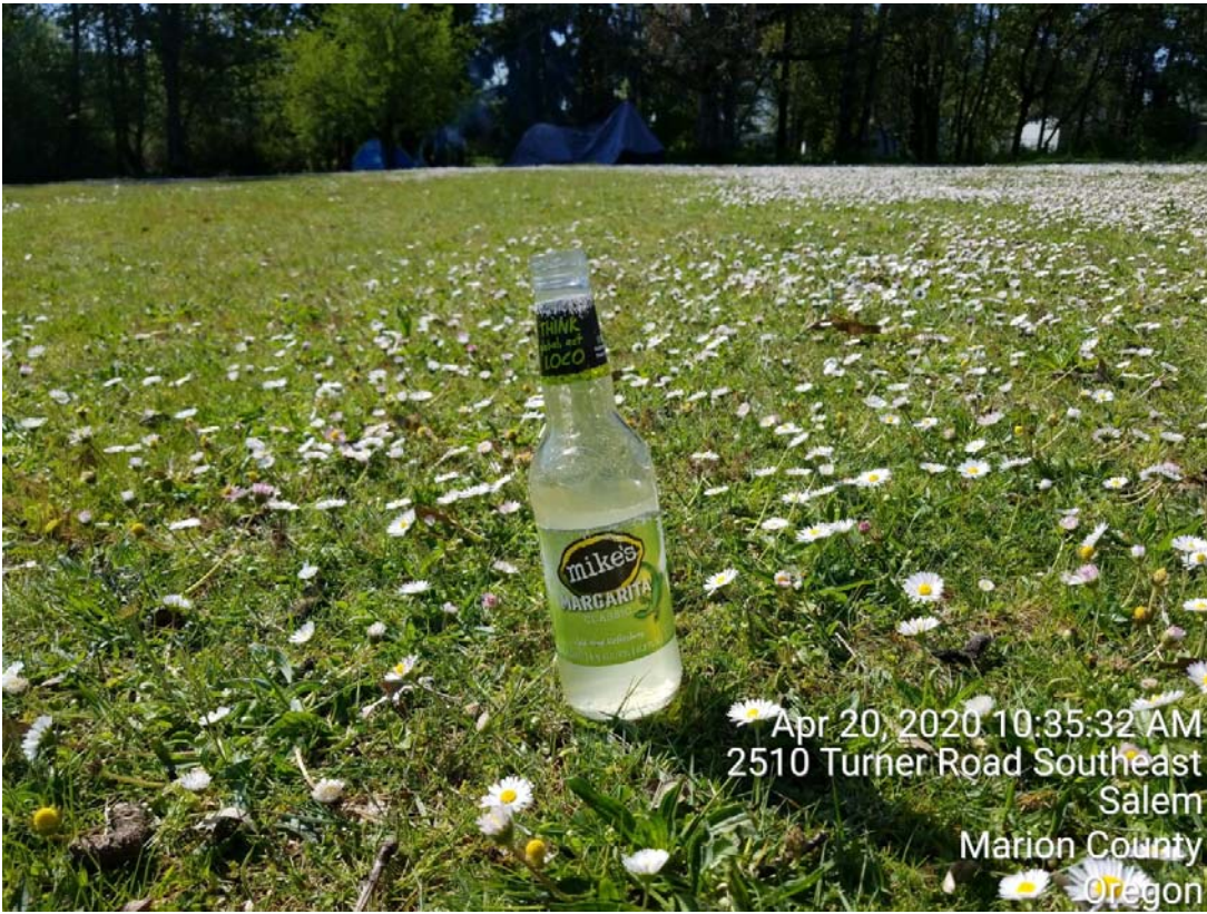
Alcohol from homeless campers left on disc golf course.