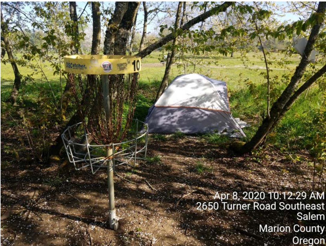
Homeless Trespasser in Paradise Island Park. He told park staff that he was looking for a place to take drugs.

Apr 8, 2020 10:12:29 AM 2650 Turner Road Southeast Salem Marion County Oregon