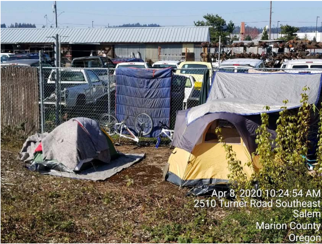
Campsites immediately adjacent to businesses.