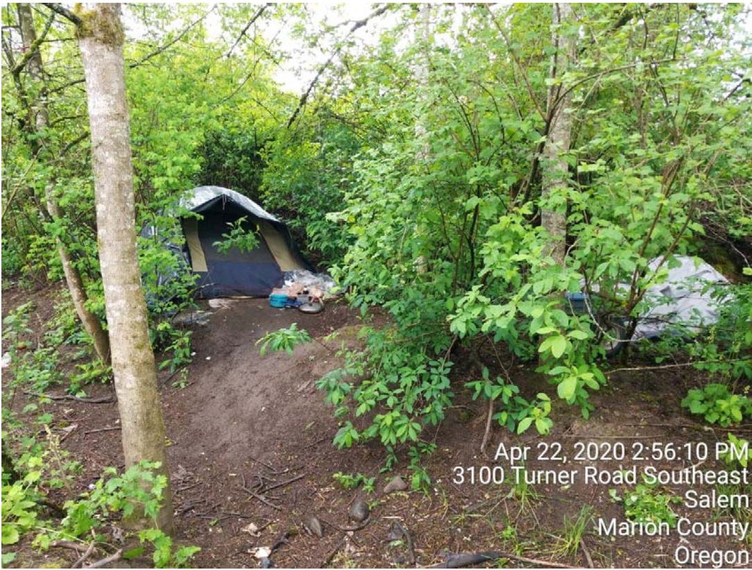
Homeless campsite on Disc golf course.

Apr 22, 2020 2:56:10 PM 3100 Turner Road Southeast Salem Marion County Oregon