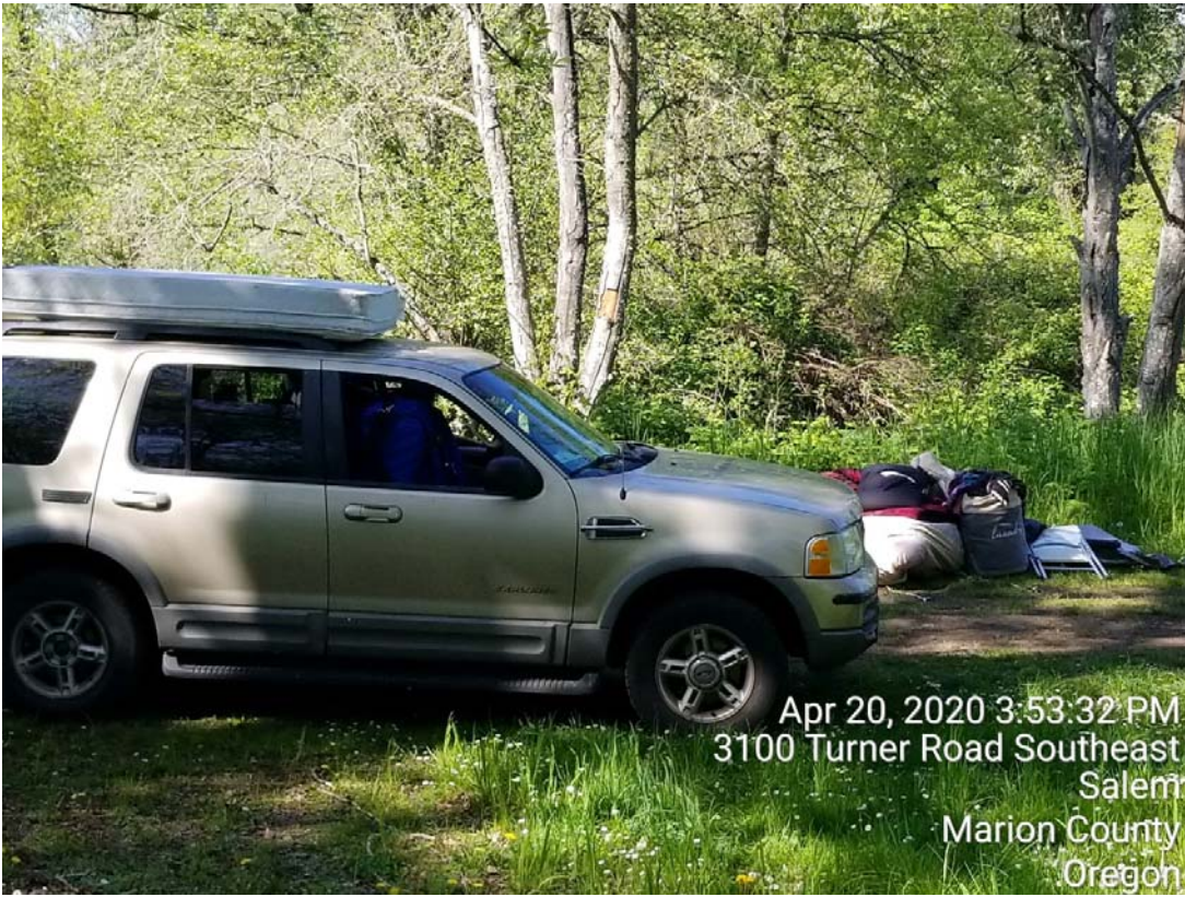
Homeless campers driving through park. ( not on roadways. )