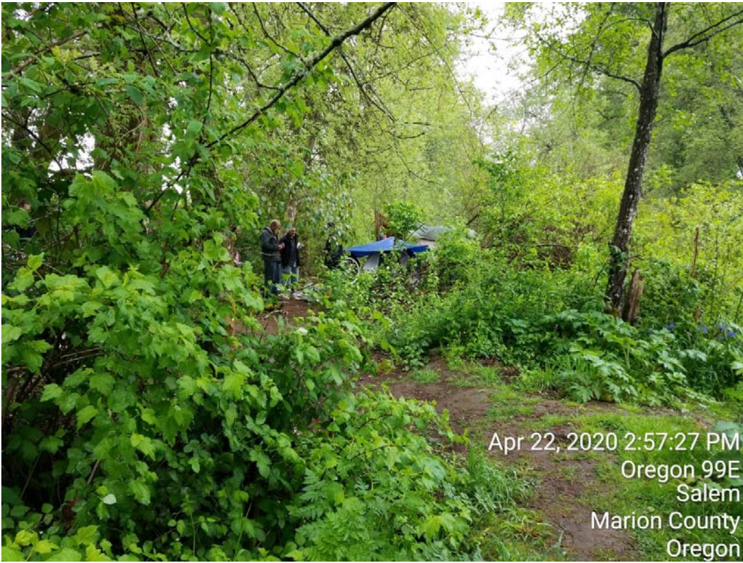
Group of homeless campers burning park trees in a campfire.