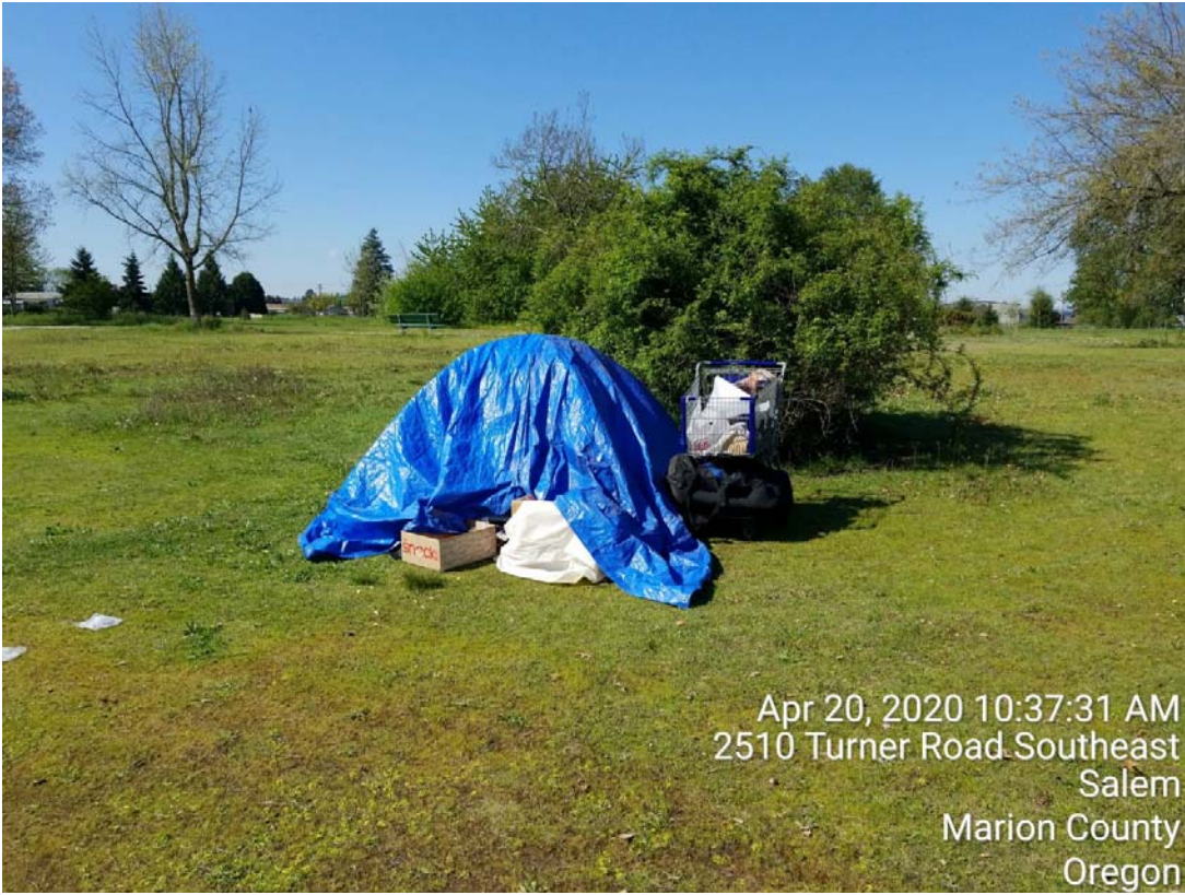
Homeless campsite on disc golf course.