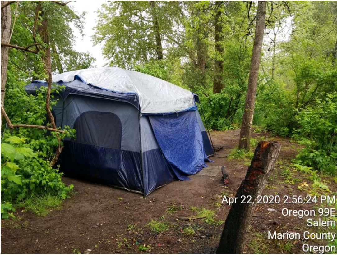
Homeless campsite on an ecologically sensitive creek bank.

Apr 22, 2020 2:56:24 PM Oregon 99E Salem Marion County Oregon