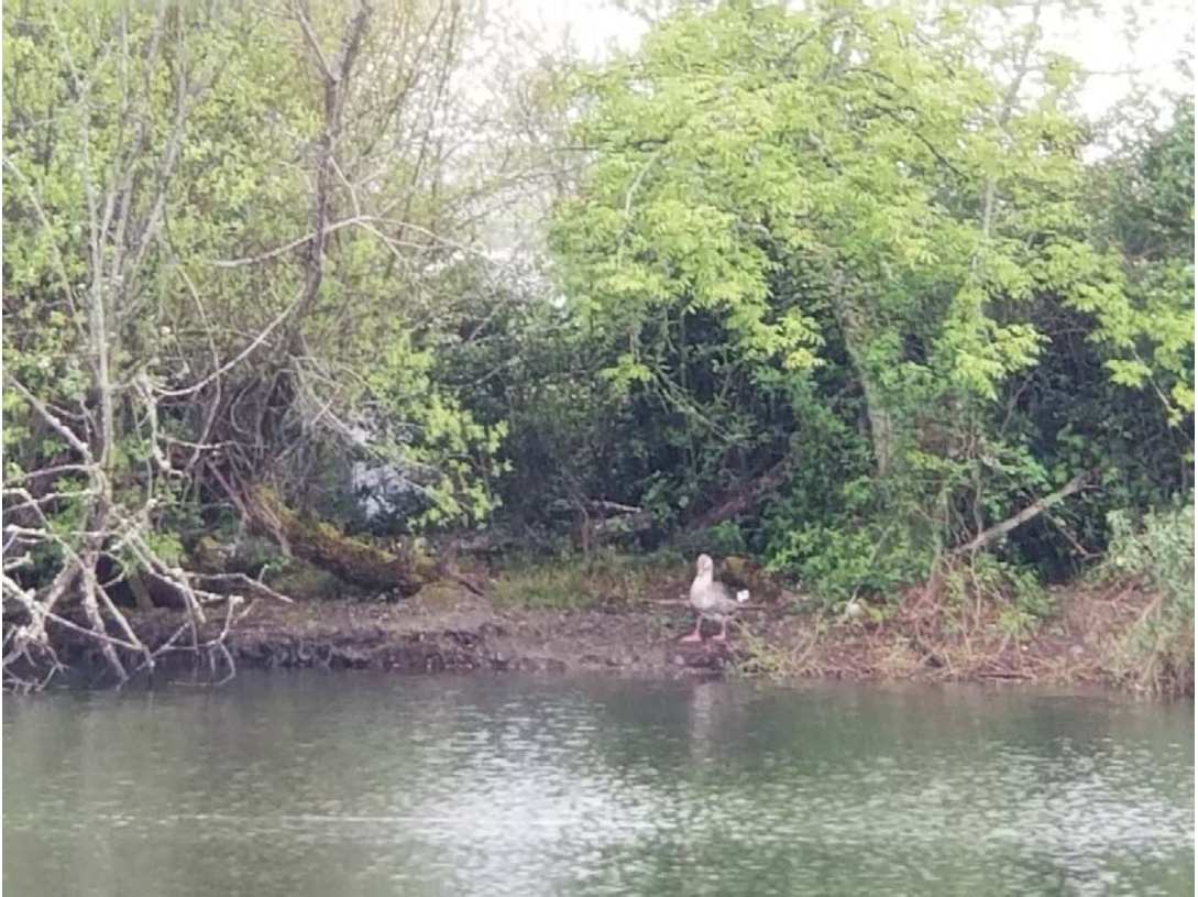
Campsite on the protected island in Wirth lake. Normally a nesting site for wild birds.