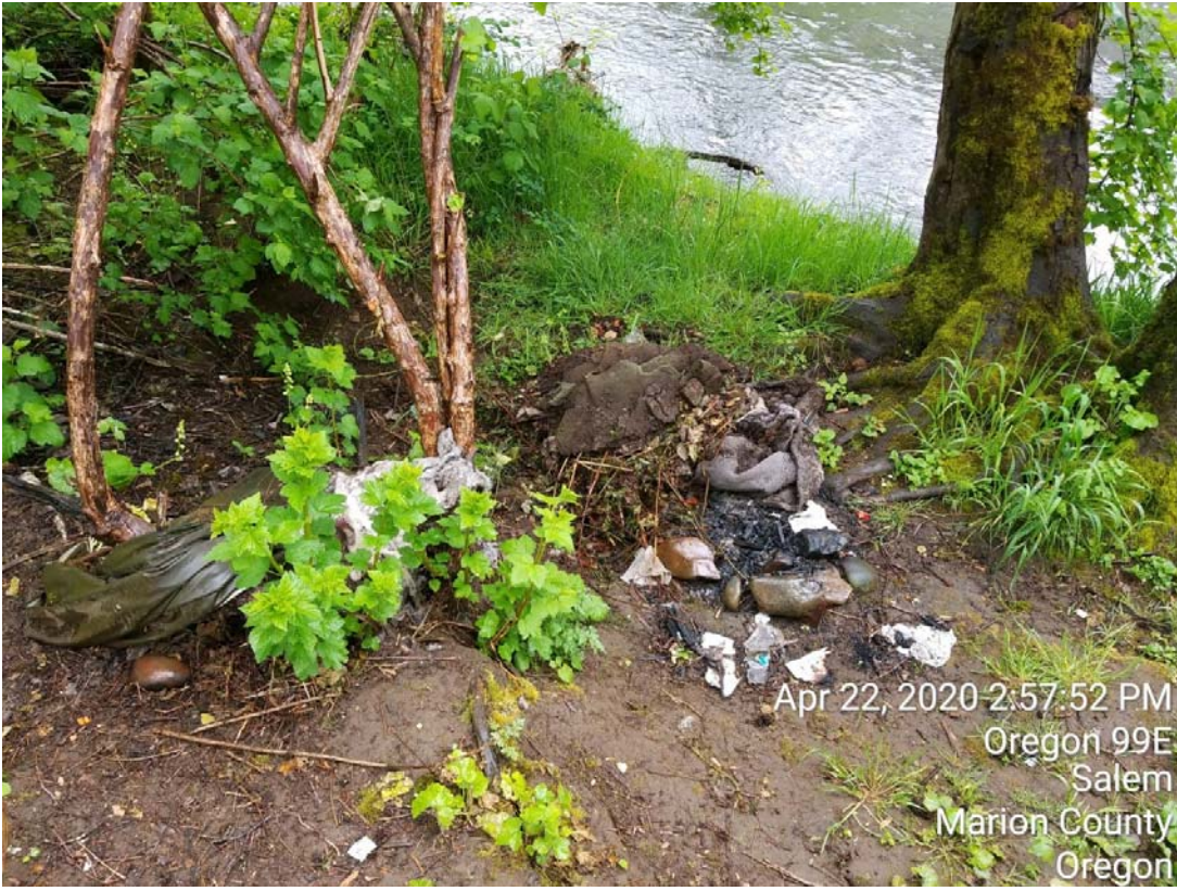
Burned garbage immediately adjacent to Mill Creek, next to homeless campsite.