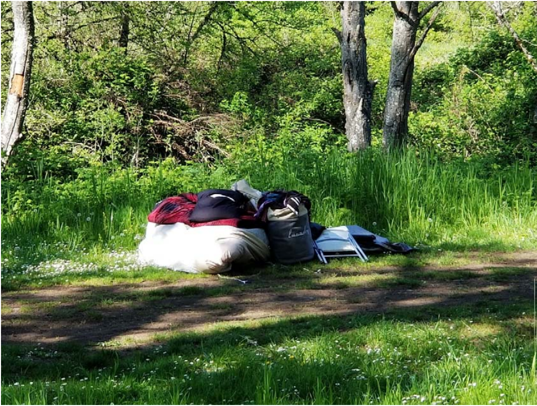
Homeless campsite less than 50ft from Paradise Island Mobile home park.