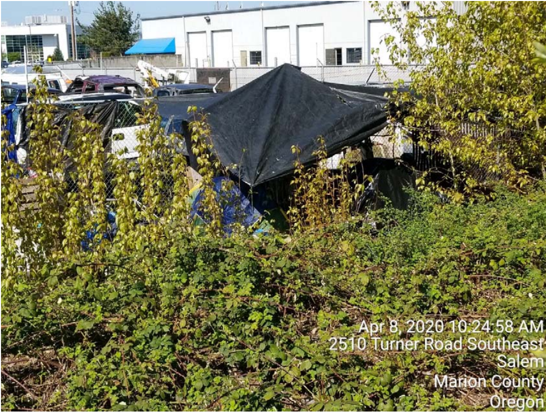
Campsites adjacent to neighboring businesses.