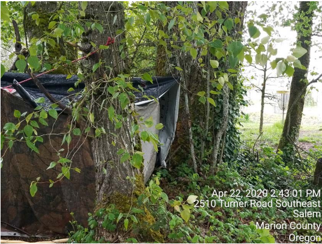
Campsite with large amounts of garbage on disc golf course.