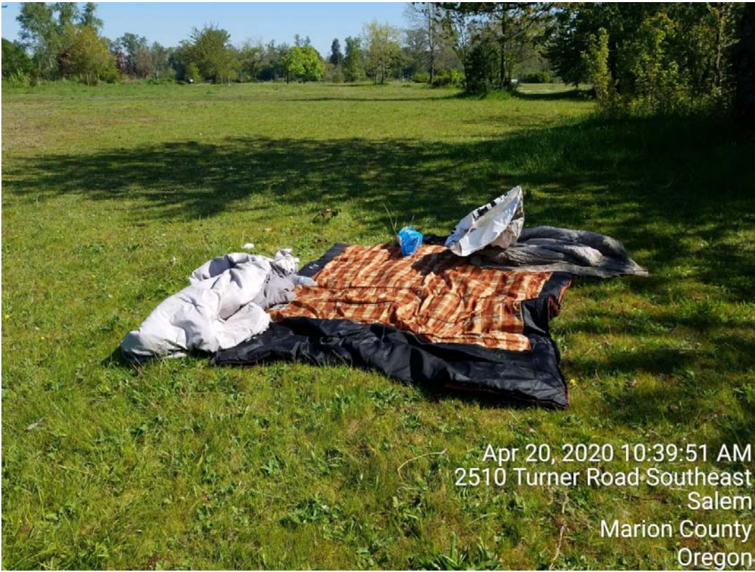
Homeless campsite on disc golf course.