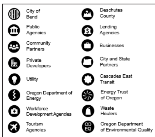
Figure 1: City of Bend Implementation Responsibilities

CAPs also contain GHG reducing actions over which the municipality has little to no control. Most CAPs reviewed for this report identify opportunities to engage with community partners to help accomplish goals and meet targets. For example, partnerships have been useful for communities that have goals for significant reduction of residential energy consumption. The City of Bend has a simple visual representation for implementation responsibilities ( See Figure 1 ). Note that this implementation table does not determine the specific department within the City of Bend and remains vague on purpose. Omitting a specific department allows the Bend flexibility of spreading and sharing departmental responsibility. In addition to flexibility, often the action items do not fall squarely within the purview of a single department and therefore require a multi-department led implementation.