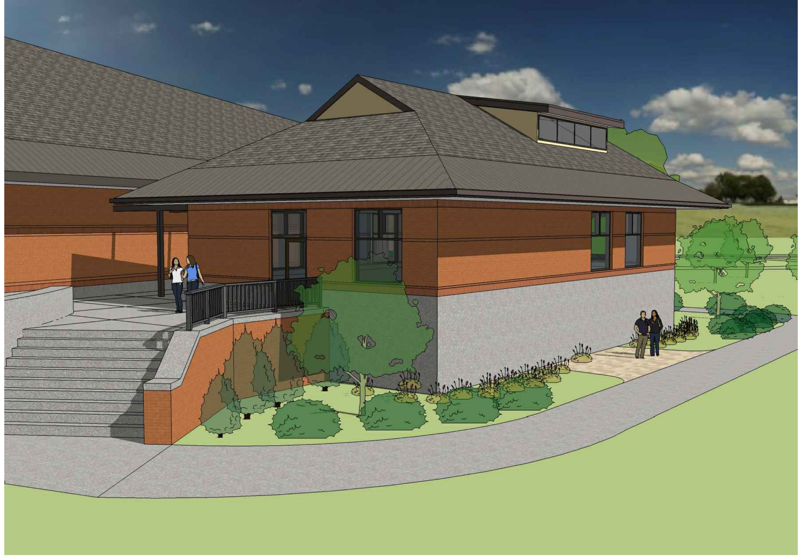
WEST VIEW (ORIGINAL BUILDING DESIGN)