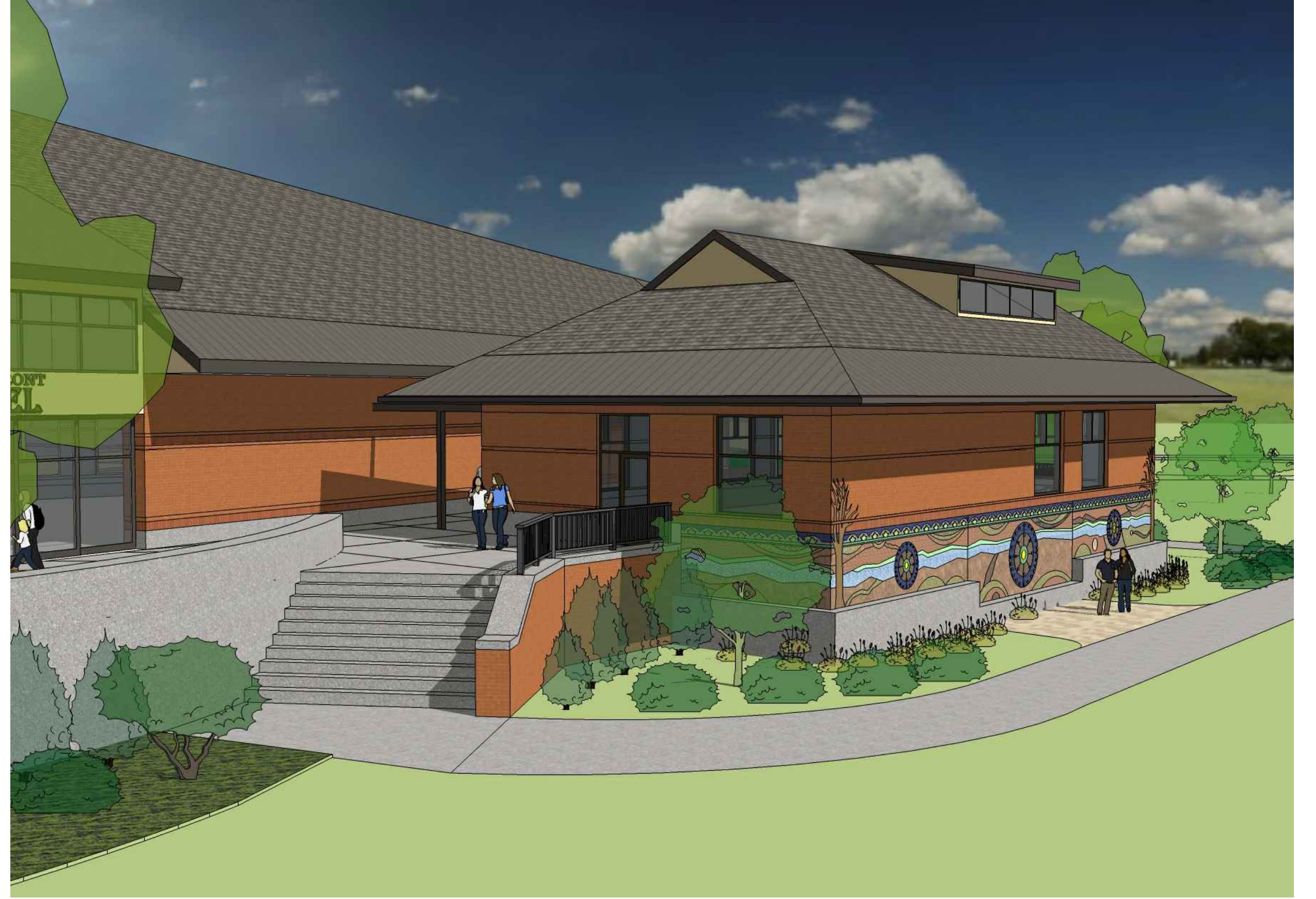
WEST VIEW WITH TILE MOSAIC