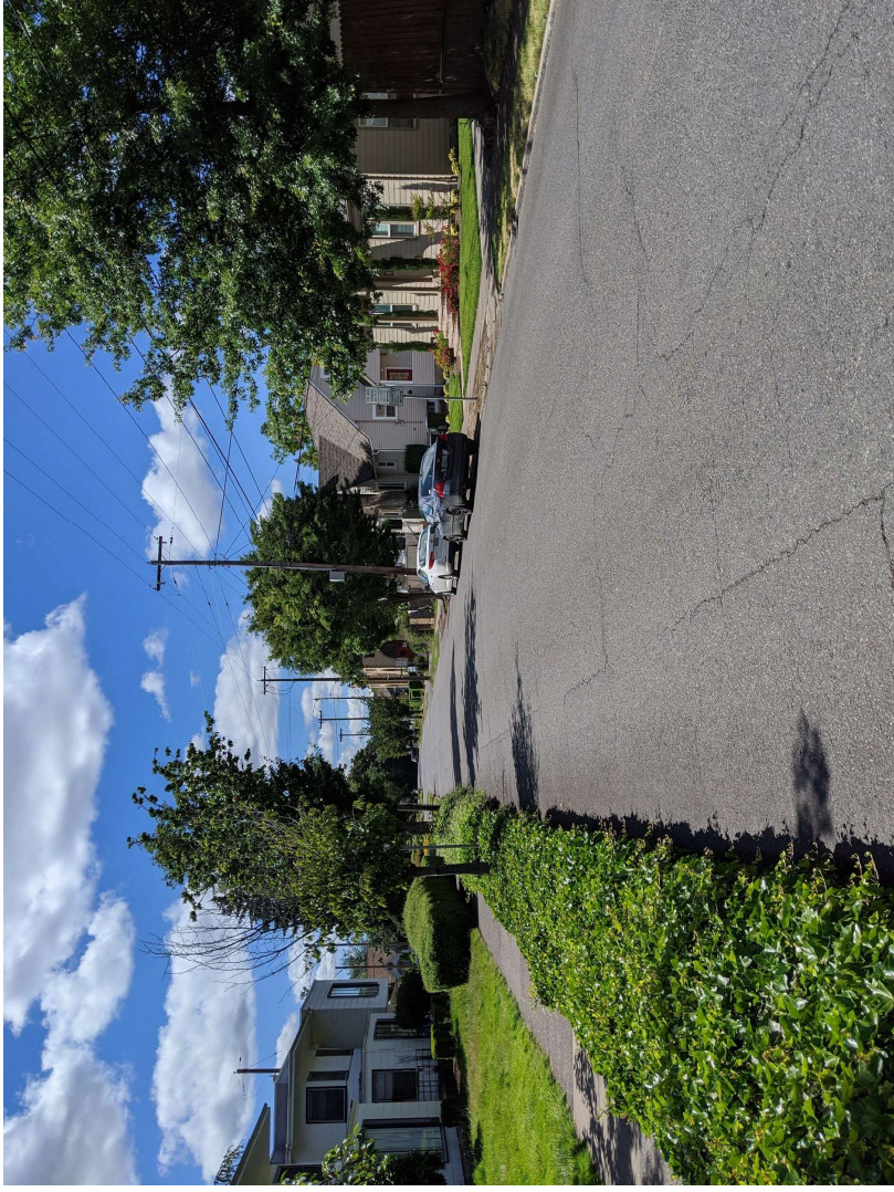
This is a view from the southwest corner of D Street NE and Winter Street NE looking west. Evergreen Church can be seen on the right side of the photo in the distant background. This street has fewer trees and homes are closer to the street. To the right, are four single family homes and to the left are two older multi-family units; a 1976 fourplex at this street intersection and a 1945 duplex on the lot to the west of the duplex.