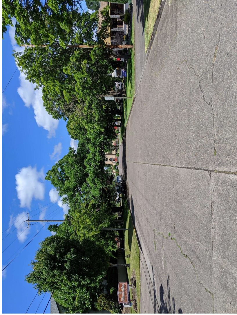
This is a view from the center of Cottage Street NE looking north towards the south side of the church. Evergreen Church can be seen in the center of the photo through the tree canopy. This street is heavily tree lined with wide parking strips. To the left is an older apartment complex along with several homes farther north. To the right is the Windsor Rehabilitation Center.