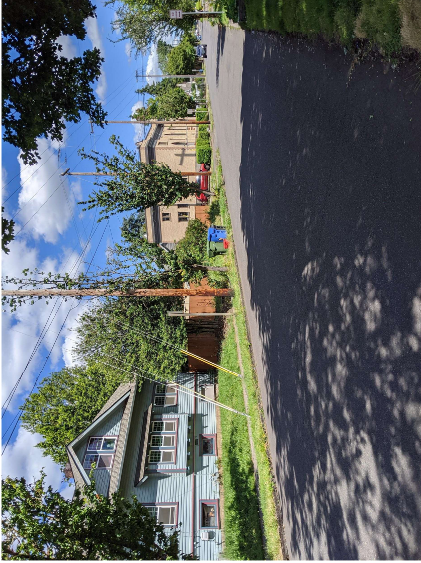
This is a view from the south side of D Street NE and Church Street NE intersection looking east. Evergreen Church can be seen in this photo along with the house on the northeast corner of the D Street NE and Church Street NE intersection.