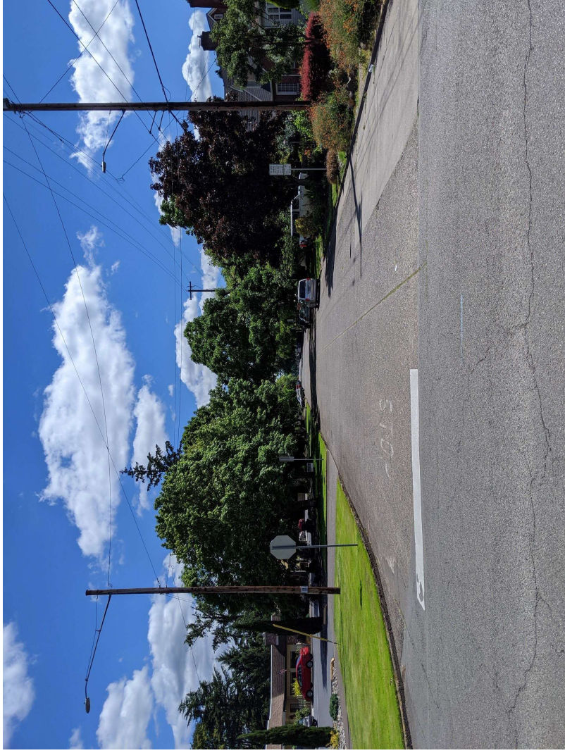
This is a view from the center of D Street NE looking south from the south side of the church. Evergreen Church is immediately behind the photographer. This street has a wide planting strip on each side. To the left, is the Windsor Rehabilitation Center, built in 1974, and to the right are four older single family homes, all located between D Street NE and Mill Creek..