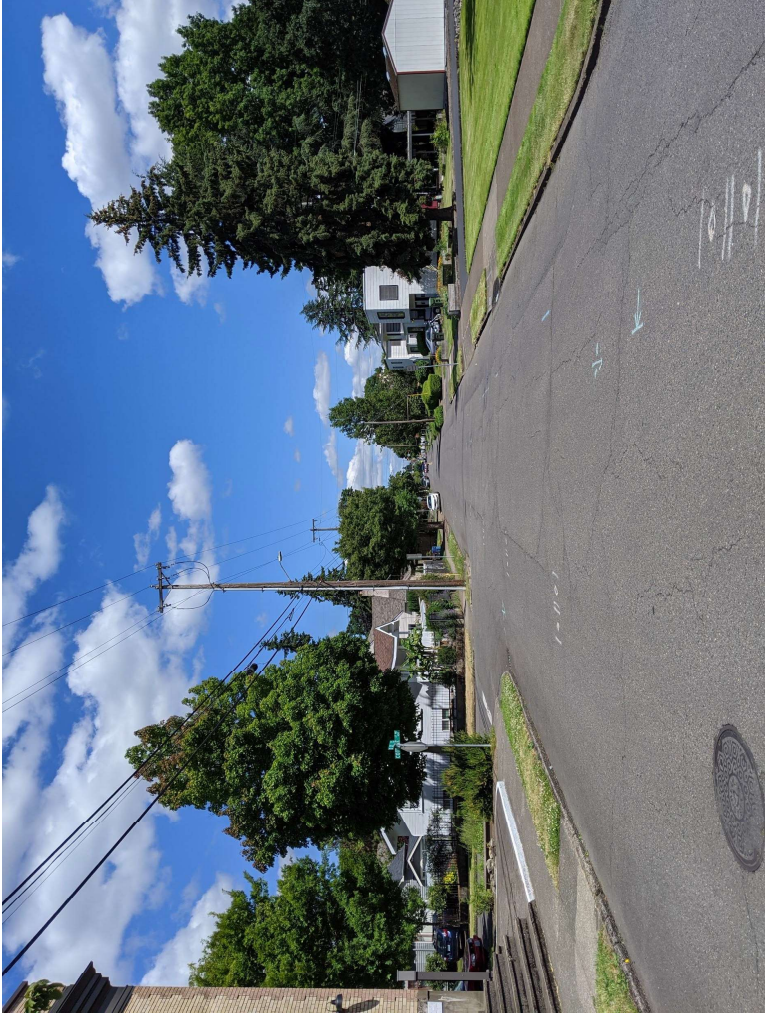
This is a view from the center of D Street NE looking east from the south side of the church. Evergreen Church can be seen at the left side of the photo. This section of D Street NE has fewer trees because of the narrower right-of-way and small parking strip. Homes are closer to the street. Between Cottage Street NE and Winter Street NE, there are 4 single family homes on the North (left) side. To the right, is the northern edge of Windsor Rehabilitation Center. In the distance on the right is a 1945 duplex with a 1976 fourplex farther east at the intersection of D Street NE with Winter Street NE. The has driveway and garage parking and the four-plex has parking in the rear off of an alley.