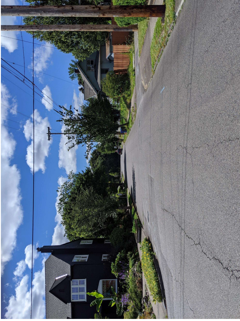
This is a view from the center of D Street NE looking west from the south side of the church. Evergreen Church is just to the right. This street has four single family homes on each side of the street and is also mostly tree lined.