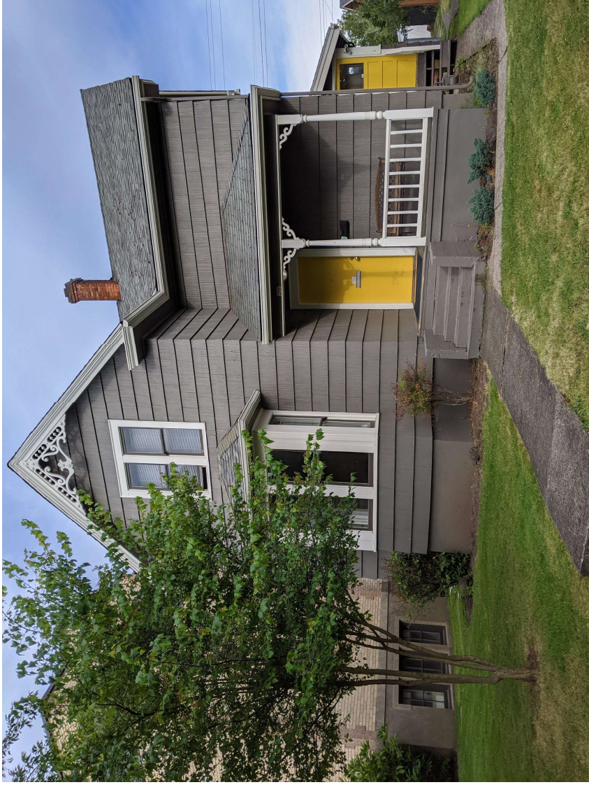
This is a view of the Parsonage from the northeast corner of the property on Cottage Street NE. The house has a few decorative features that highlight that it was from the Victorian era, such as the adorned gable and porch. The house still has its original lamb tongue window sashes.