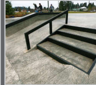
2. Down Rail