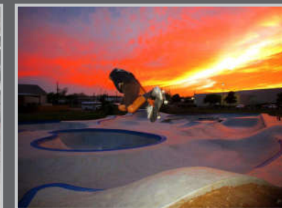
8. Jumps and Transfers