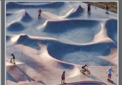
6. Flow Zone