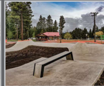
5. Cantilevered Edge