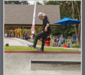
3. Bank to Ledge