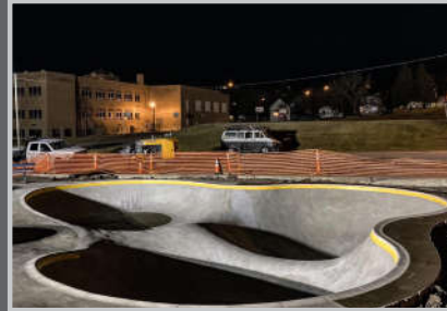
1. Clover Bowl