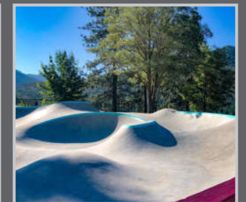
9. Mooncape with Small Transitions