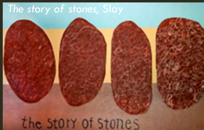
The story of stones, Sloy