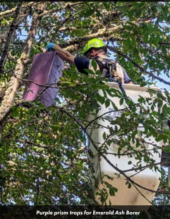
Purple prism traps for Emerald Ash Borer