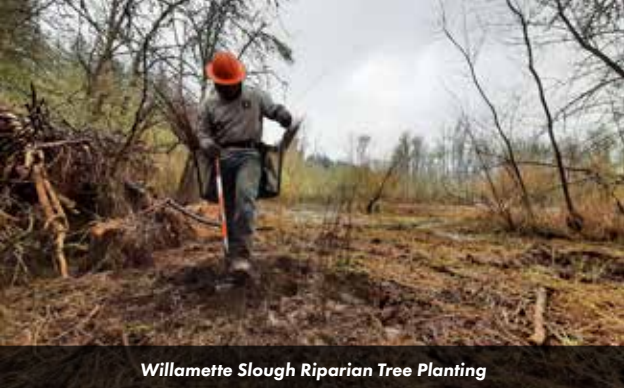
Willamette Slough Riparian Tree Planting