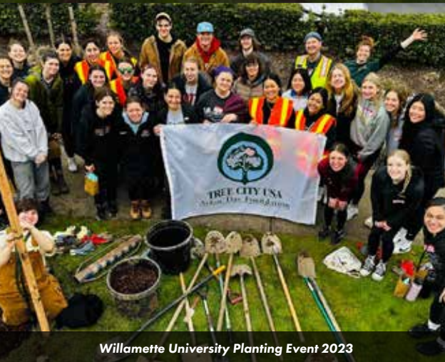
Willamette University Planting Event 2023