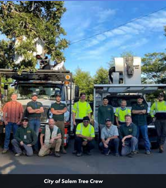
City of Salem Tree Crew