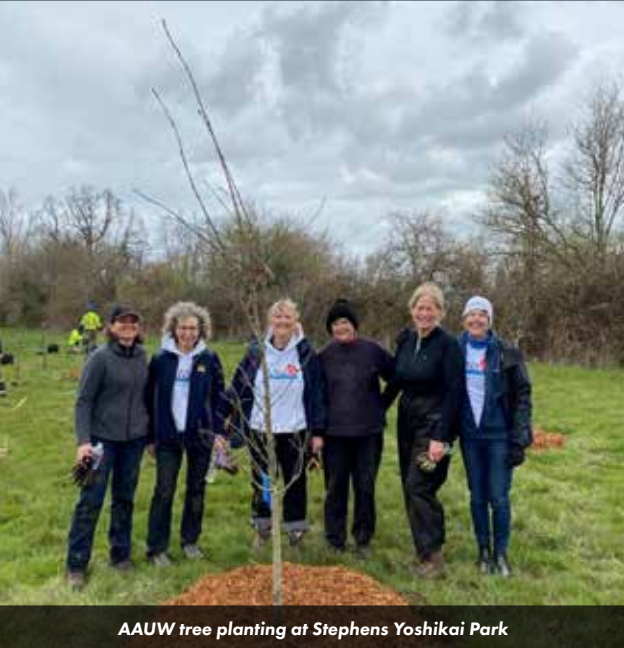
AAUW tree planting at Stephens Yoshikai Park