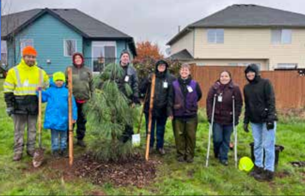
Friends of Trees-Eagles View Park