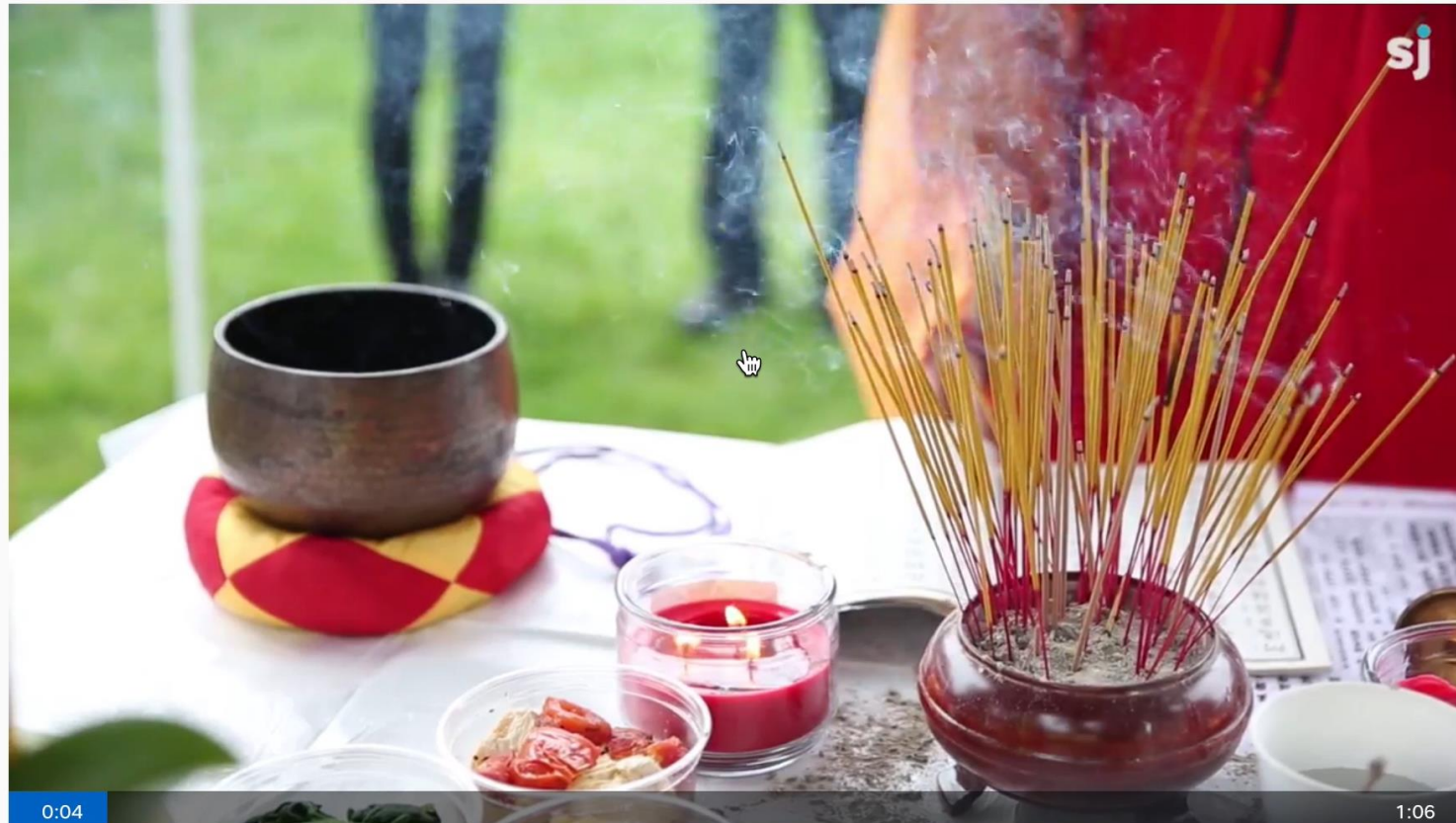
The traditional Chinese festival honors ancestors and the start of spring.