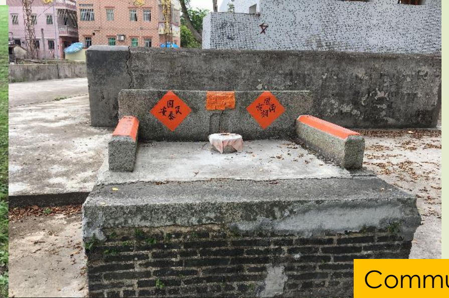
Community Shrines in Canton China